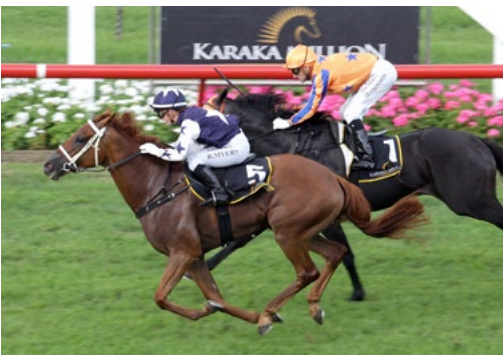
Scott Base (NZ) (Dalghar)