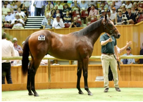
Lot 156 Fastnet Rock ex Diademe

something special when Lot 156 entered the Karaka sale ring and the Curraghmore principal wasn't disappointed.