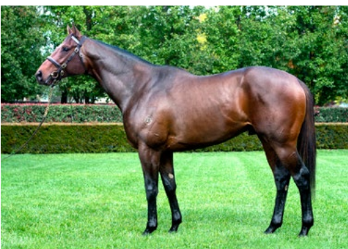
Lot 179 Ghibellines ex Ears Carol