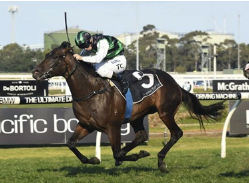
Addictive Nature (Savabeel)