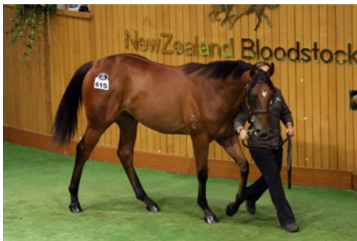
Lot 615 Holy Roman Emperor ex Spina Rosa

Having secured three colts during the Book 1 sale, the partners had been active inspecting individuals throughout the day despite inclement conditions, including driving rain for long periods, forcing many to seek shelter wherever possible. Full story here