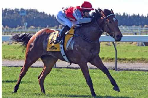
Blanco Belle (NZ) (Cape Blanco)