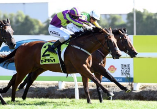
Start Wondering (NZ) (Eighth Wonder)

Scott Base's Ellerslie success elevated him to equal $6 favouritism with Demonetization (All Too Hard) for the Gr.1 Vodafone New Zealand Derby (2400m).