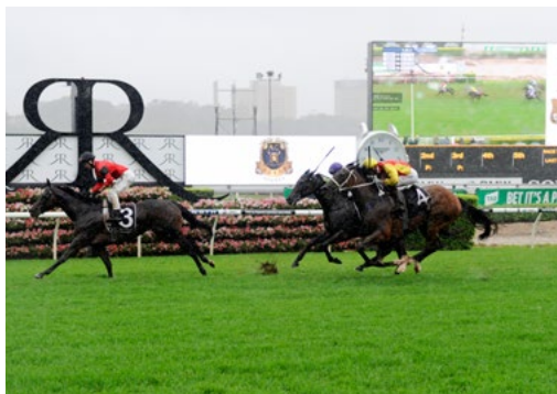
La Diosa (NZ) (So You Think)