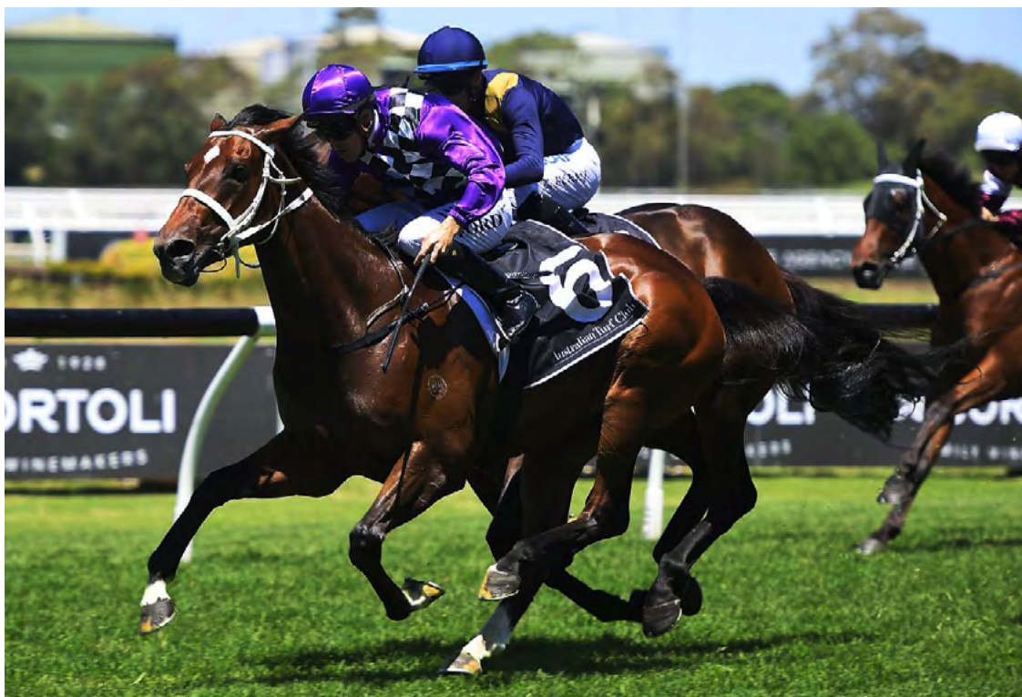
Undefeated three-year-old Zalatte (NZ) (Medaglia d'Oro)