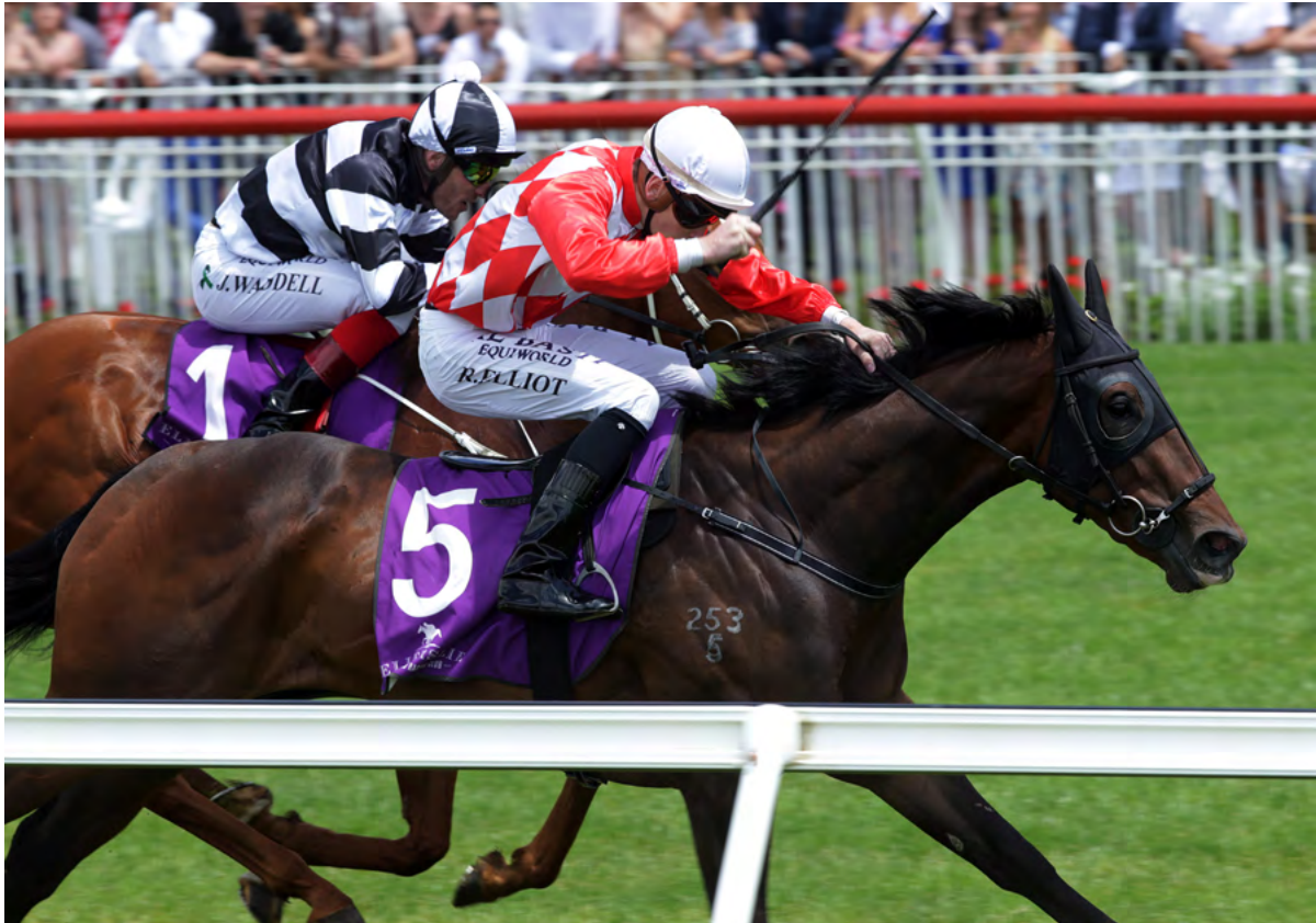
Hypnos charges along the rail to defeat Dawn Patrol at Ellerslie