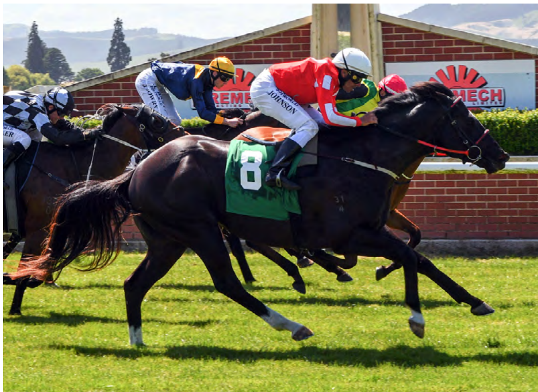
Sensei prevails in a desperate finish to the feature race at Wingatui, the Listed Allied Security Hazlett Stakes

“On that performance he was always going to be hard to beat today, so we went into the race with plenty of confidence.”