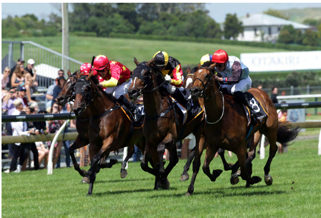
Pinmedown (outer) defeats House Of Cartier (middle) and Queen Of Diamonds in the Gr.2 Cambridge Stud Eight Carat Classic