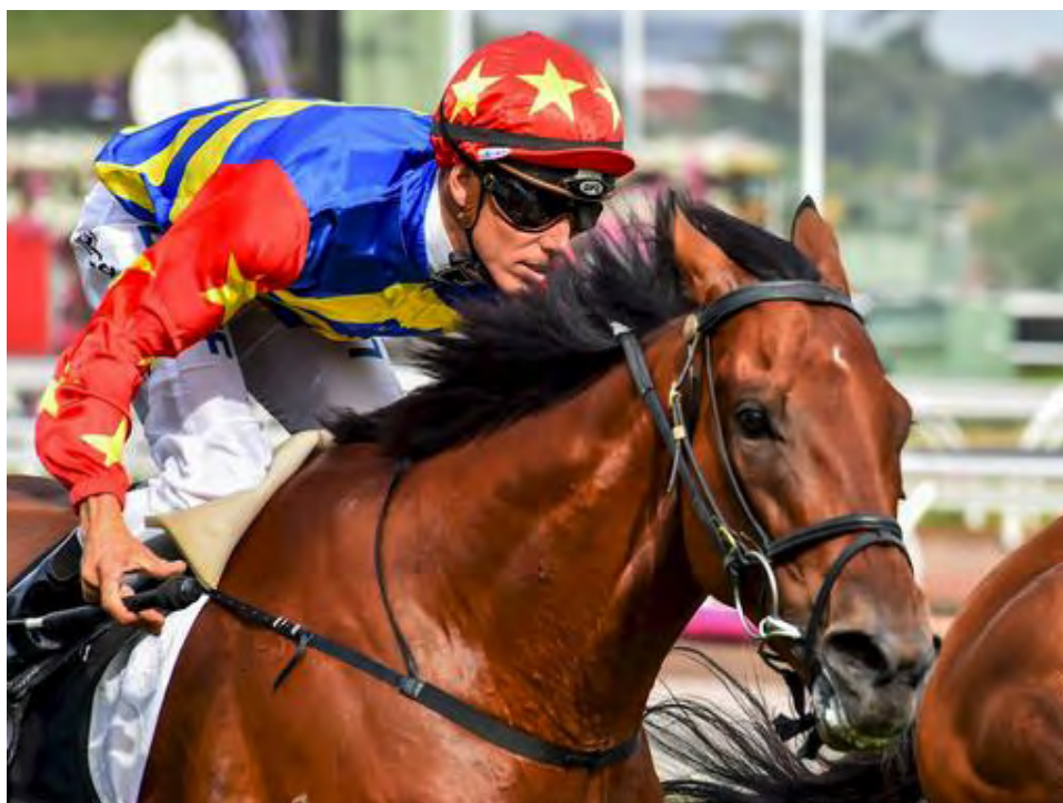
NZB Ready To Run Graduate Rock 'N' Gold