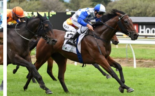
Charles Road (Myboycharlie)

Dee's Ellerslie rides also include Princess Rihanna (NZ) (Showcasing) in the Gr.2 Cambridge Stud Eight Carat Classic (1600m) and the two-year-old Nirvana In Fire (NZ) (Showcasing).