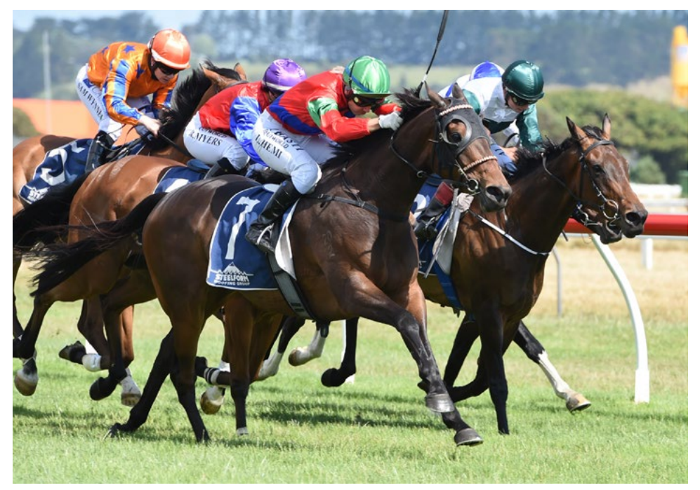
- NZ Racing Desk.

Of Hemi's other mounts, she expected another bold run from her last-start Waipukurau winning ride Cornerstone (NZ) (Road To Rock) and also from the resuming Ollie's Note (NZ) (Gallant Guru).