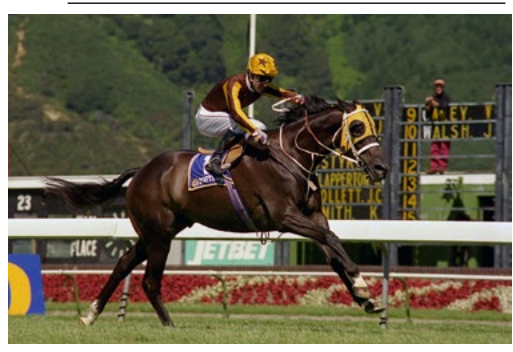
Castletown (NZ) (One Pound Sterling)

A former Group One-winning jockey, he produced Strike the Tiger (Tiger Ridge) to win the 2009 Listed Windsor Castle Stakes (1000m) and the following day stablemate Jealous Again (Trippi) claimed the Gr.2 Queen Mary Stakes (1000m). <u>Full story</u> here