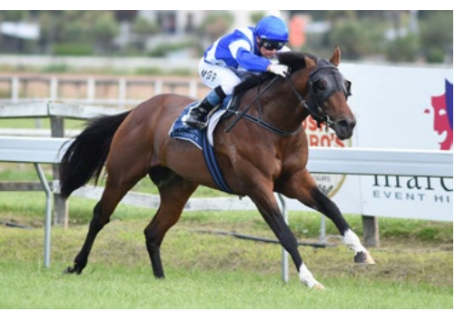
Cut Me Loose (NZ) (Swiss Ace)

His half-brother (Lot 469) by Ocean Park will be offered by Haunui Farm at the Book 1 Sale at Karaka on January 28.