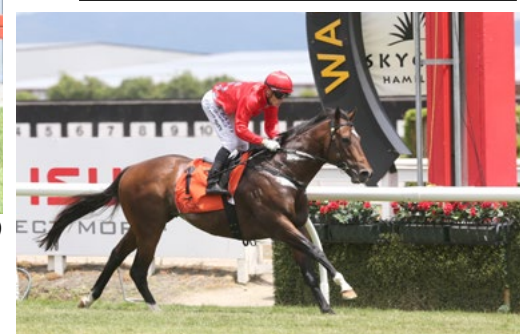
Ferrando (NZ) (Fast 'n' Famous)

She will now be set for the Gr.3 Concorde Handicap (1200m) at Ellerslie on January 27.