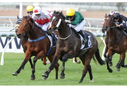
Benzini (Tale Of The Cat)

"I'm looking forward to catching up with family and friends and getting as many rides as I can," the 23-year-old said. Full story here