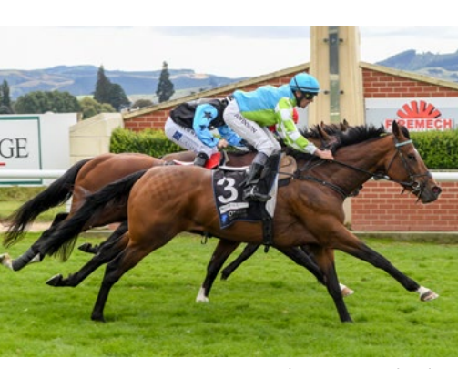
Princess Brook (NZ) (Raise The Flag)