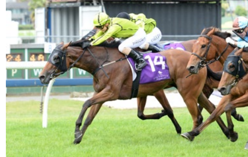
Snow Secret (NZ) (Sakhee's Secret)

Snow Secret's (NZ) (Sakhee's Secret) training regime will be changed ahead of