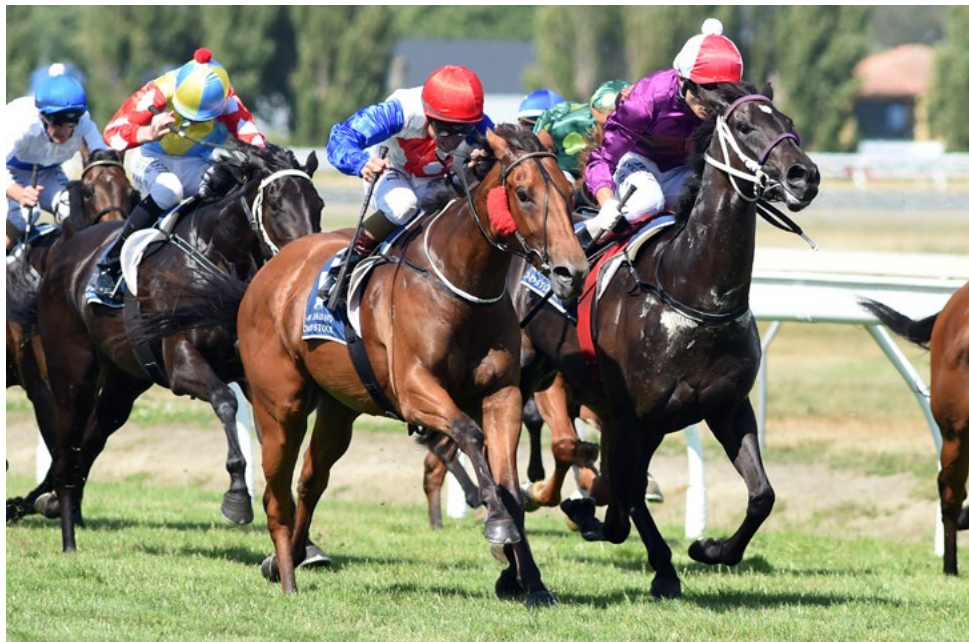
Savvy Coup (red cap, blue sleeves) gets the better of Dijon Bleu in the Gr.3 Lawnmaster Eulogy Stakes victory