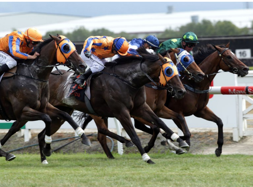
Royal Success (three off rail) holds out his unlucky stablemate Chambord (four out) in the Gr.3 J Swap Contractors Sprint