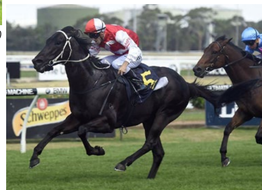
Kuro (NZ) (Denman)

Cylinder Beach (NZ) (Showcasing) will start as one of the favoured runners in Saturday's Listed Brisbane Handicap