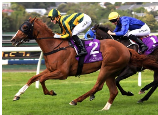
Top Prospect (NZ) (Swiss Ace)

"It will either be the Newmarket or the Railway, but with the set weights and penalties he does get in well in the Railway,"