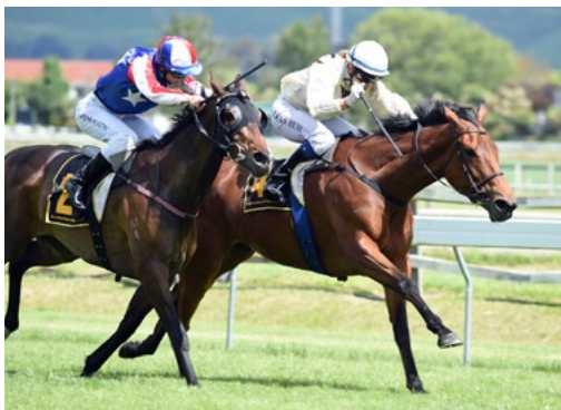
La Fille En Jeu (NZ) (Mettre En Jeu)

"He was finding the line really well in the Festival Stakes and the post just came too soon really."