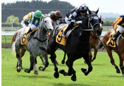
Five To Midnight (NZ) (Domesday)

"We're going to have a crack at black type – she deserves a shot at it," said Auret, who