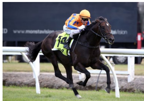
Xtravagant (NZ) (Pentire)

The Gallant Guru seven-year-old opened his winning streak at Timaru before he added further Rating 85 successes at Oamaru and Wingatui. Full story here.