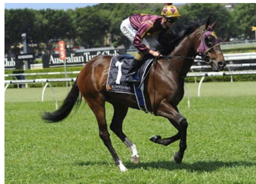
Cylinder Beach (NZ) (Showcasing)

La Fille En Jeu is a genuine home product being a daughter of Mettre En Jeu, who stands at the family's Letham Thoroughbreds operation on the outskirts of Wanganui.