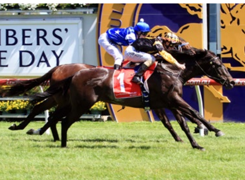
Jacqui's Joy (NZ) (Real Saga)

Iggi Pop was last seen earlier this month running third in the ATC Cup (2000m) off the back of a November Topaz (1900m) third at Rosehill.