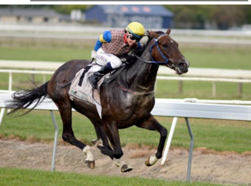
Iamishwara (NZ) (Keeninsky)