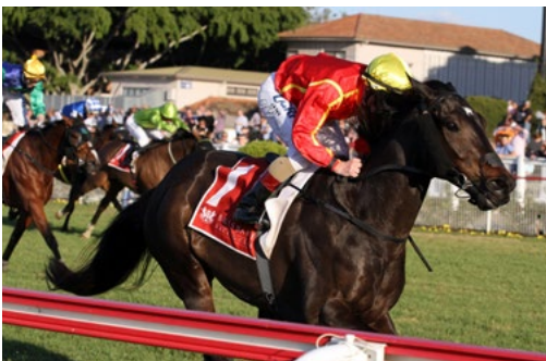
Iggi Pop (NZ) (Savabeel)

Kuro was purchased by Champion Thoroughbreds from the draft of Curraghmore Stud at the 2013 NZB Premier sale for $170,000.