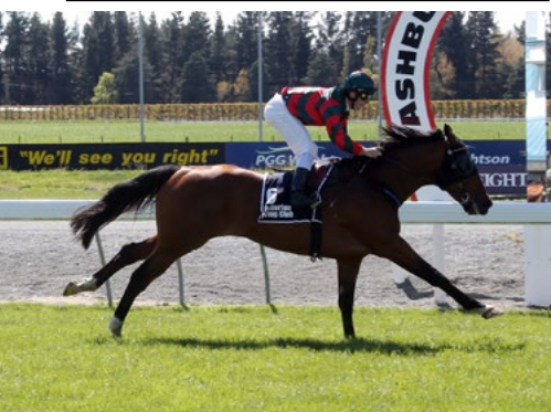
Cha Siu Bao (Smart Missile)

"We haven't finalised it yet, but that's the way we'll probably go now. The way he performed the other day showed he's going just as well as he was this time last year." Full story here.