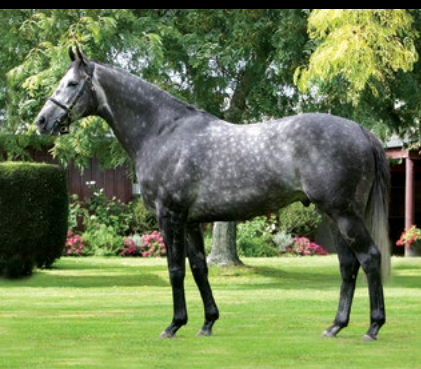
DALGHAR (Fr) Anabaa - Daltawa, Miswaki