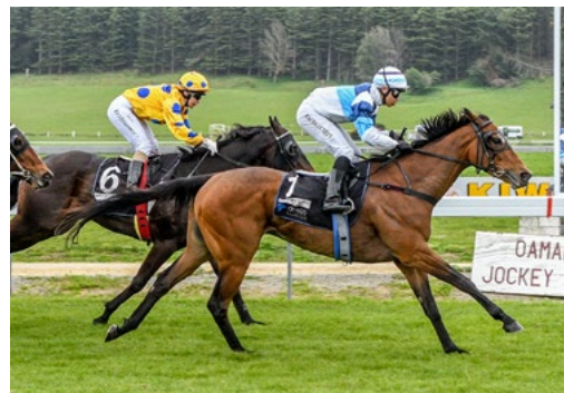
Somethings Burning (NZ) (Gallant Guru)