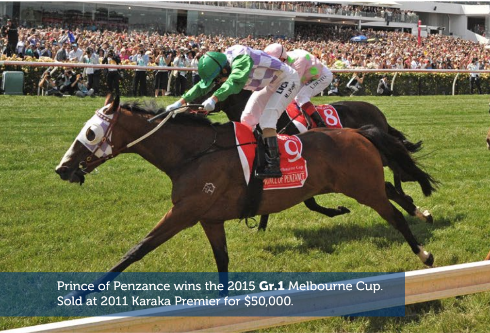
Prince of Penzance wins the 2015 Gr.1 Melbourne Cup. Sold at 2011 Karaka Premier for $50,000.