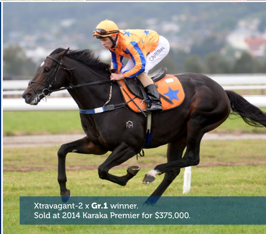
Xtravagant-2 x Gr.1 winner. Sold at 2014 Karaka Premier for $375,000.

Pentire, Shocking, Jimmy Choux, Tavistock, Fastnet Rock, Pins, Reliable Man, Myboycharlie, Super Easy, Zacinto, Showcasing