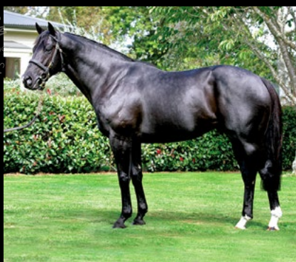
PERFECTLY READY (Aus) More Than Ready - Elle Duccio, Danehill