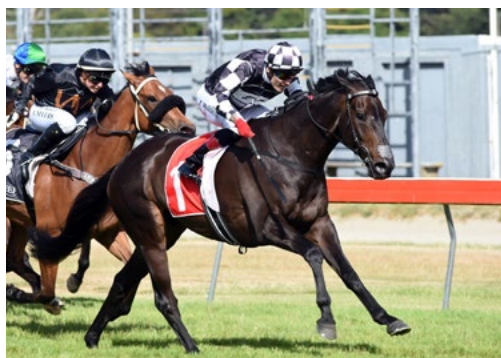
Kawi (NZ) (Savabeel)