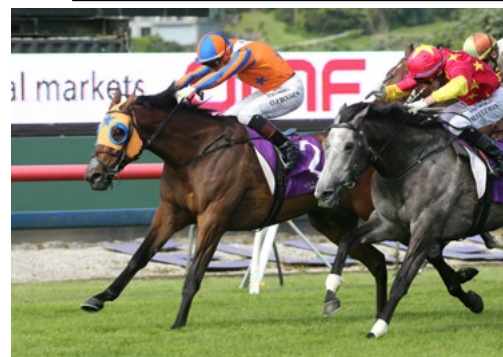
Chance To Dance (Teofilo)

year to lose a pair of talented horses in the multiple winners Galloping Gerte (NZ) (Align) and Cantare (NZ) (Per Incanto). Full story here