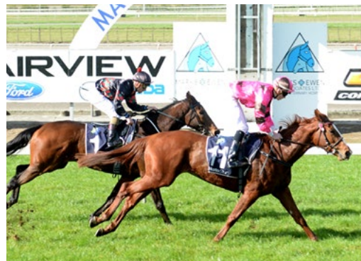
Brookbars (NZ) (Bullbars)

year to lose a pair of talented horses in the multiple winners Galloping Gerte (NZ) (Align) and Cantare (NZ) (Per Incanto). Full story here