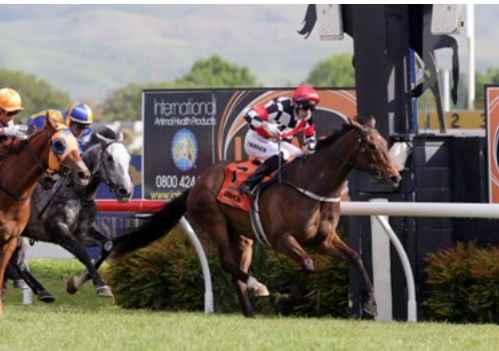
Wait A Sec (NZ) (Postponed)

A last-start third in the Gr.3 Eagle Technology Stakes (1600m), Volkstok'n'barrell has been set for the Gr.1 Zabeel Classic (2000m) at Ellerslie on Boxing Day. He finished runner-up to Consensus (NZ) (Postponed) in the weight-for-age feature last year.