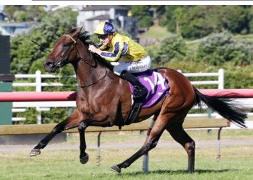
Princess Rihanna (NZ) (Showcasing)