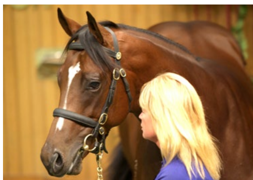
Mr Stunning (Exceed And Excel)