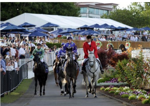
Monrecour (NZ) (Zacinto)