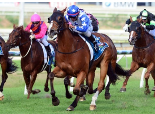
Crack Me Up (NZ) (Mossman)