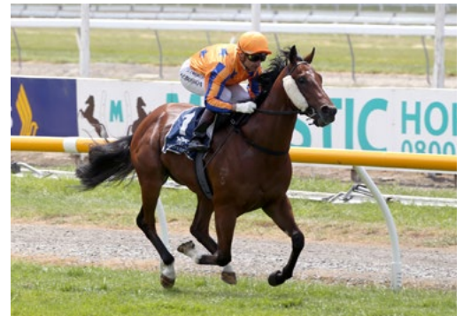
Al Hasa (NZ) (Exceed And Excel)

Impressive last-start winner Al Hasa (NZ)