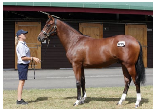
Beauty Generation (NZ) (Road To Rock)