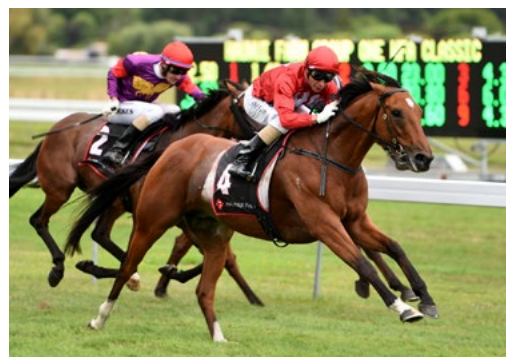
Volkstok'n'barrell (NZ) (Tavistock)

Beauty Generation secured his first Group One victory in the Longines Hong Kong Mile (1600m), while the farm's poster child Werther put in a strong runner-up performance in the Gr.1 Longines Hong Kong Cup (2000m). Full story here