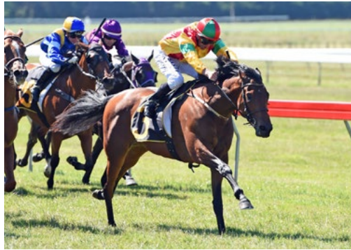
Matchbreaker (NZ) (Makfi)

The three-year-old won two of his three starts, including a last-start success in the Gr.3 Wellington Stakes (1600m) which sparked intense overseas interest that has now resulted in his big money move to Hong Kong.