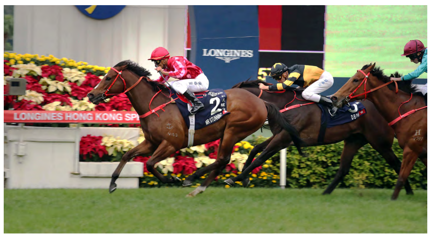
Mr Stunning holds out D B Pin (inner) and Beat The Clock to win back-to-back Longines Hong Kong Sprint titles

trio of New Zealand Bloodstock Sale graduates dominated the 2018 edition of the Gr. 1 LONGINES Hong Kong Sprint (1200m) at Sha Tin on Sunday.