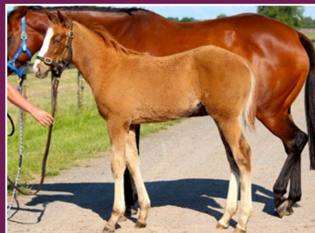
3 IN 1 - QUALITY FERLAX COLT PLUS MARE IN FOAL TO TURN ME LOOSE.