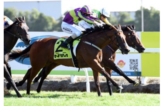
Start Wondering (NZ) (Eighth Wonder)