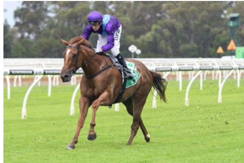
Lisdoonvarna (NZ) (Super Easy)

After one run in New Zealand for a placing on a wet track in a two-year-old race at Ruakaka last season, Lisdoonvarna started her Australian career with successive wins at