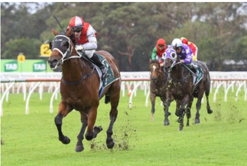
Scream Park (NZ) (Ocean Park)