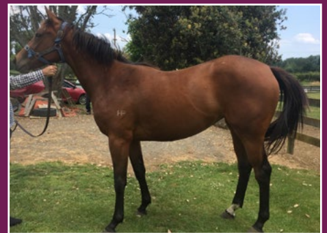
FULL-SISTER TO GR.1 WINNER CONSENSUS.