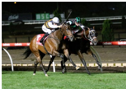
Persian Empire (NZ) (Savabeel)

A grand-daughter of the multiple Group One winner Lashed (Encosta De Lago), Divine Power's half-sister (Lot 333) by Tavistock will be offered by Cambridge Stud during Book 1 at Karaka next year.