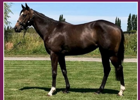
ZACINTO FILLY - BROKEN IN AND READY TO GO ON WITH.