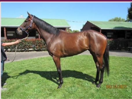
RACE OR BREED - SAVABEEL MARE.