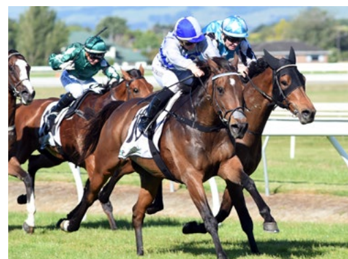
Asama Blue (Fastnet Rock)

To be ridden by Jake Bayliss, Volpe Veloce hasn't raced since she was tripped up by a Slow 9 track when unplaced in the Gr.1 Windsor Park Plate (1600m) at Hastings in September.