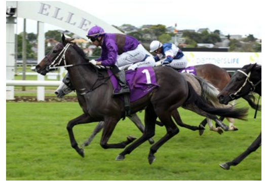
Dijon Bleu (NZ) (Burgundy)