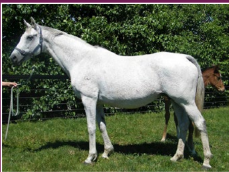
2 IN 1 - STAKES PLACED MARE WITH SHOWCASING FILLY AT FOOT.