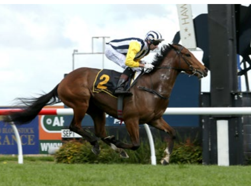
Haussmann (NZ) (Pour Moi)