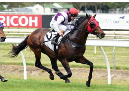
Ocean Emperor (NZ) (Zabeel)

"He will remain at the University Clinic until at least the end of the week," Te Akau said.