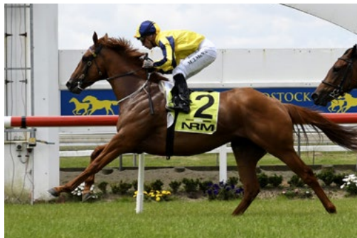
Nirvana In Fire (NZ) (Showcasing)

"The way she's going, the sky's the limit for her," he said.