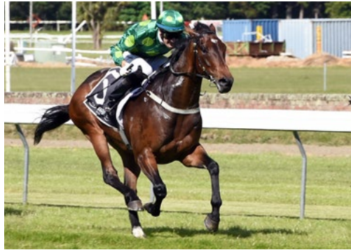
Hiflyer (NZ) (Tavistock)

"It's a dream and there's a lot of water to go under the bridge yet."