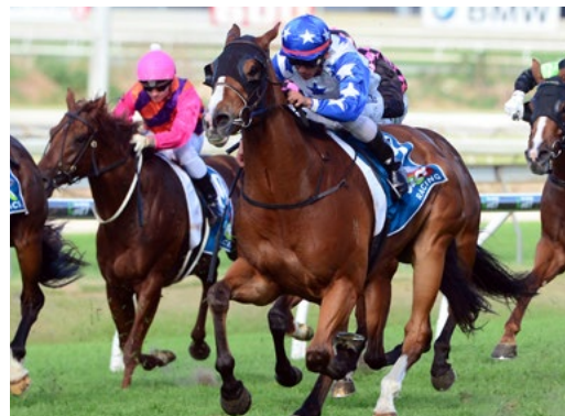
Crack Me Up (NZ) (Mossman)