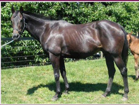
3 IN 1 - DAM OF GR.1 WINNER I/F TO IFFRAAJ & SHOWCASING FILLY.

Featuring 47 Lots including yearlings, racing stock and broodmares.