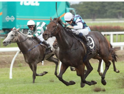
All Our Roads (NZ) (Road To Rock)