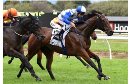
Charles Road (Myboycharlie)

Nirvana In Fire is eligible for next month's Karaka Million (1200m) and will have another chance to secure a berth in the race with past years indicating around $10,000 in stakes earnings to be the entry level. Full story here