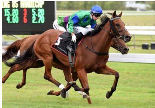
Rock My Soul (Stratum)

get too much weight. He's rated 103 now and he would get 59 or 60kg." Full story here