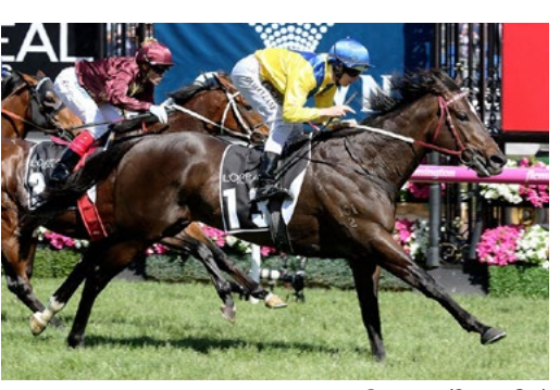
Rageese (Street Cry)