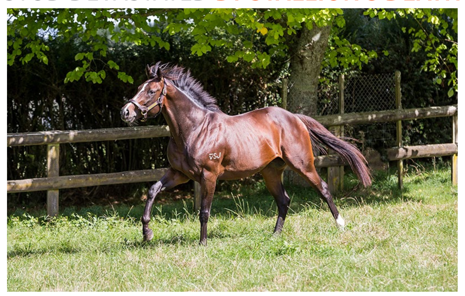
Tragedy has struck Mapperley Stud with the untimely passing of their stallion Atlante

apperley Stud are reeling following the shock death of their promising young stallion Atlante (Fastnet Rock).