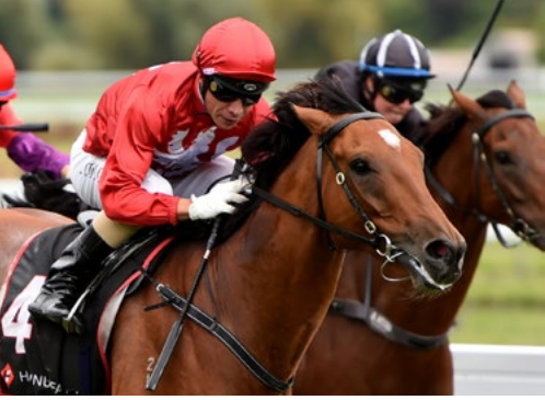
Volkstok'n'barrell (NZ) (Tavistock)

"I think he raced incredibly well, he's just such a genuine horse and he has tightened up nicely for the Captain Cook." Full story here.