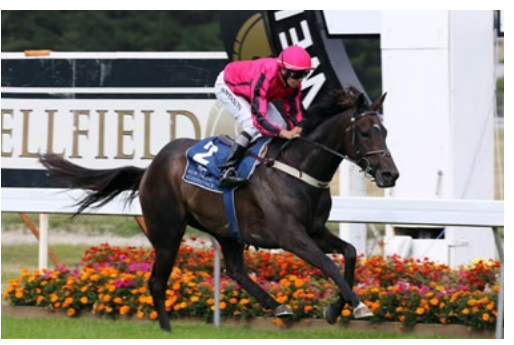
Natuzzi (NZ) (Coats Choice)

Rageese's next aim will be the Gr.2 Villiers Stakes at Randwick on December 17.