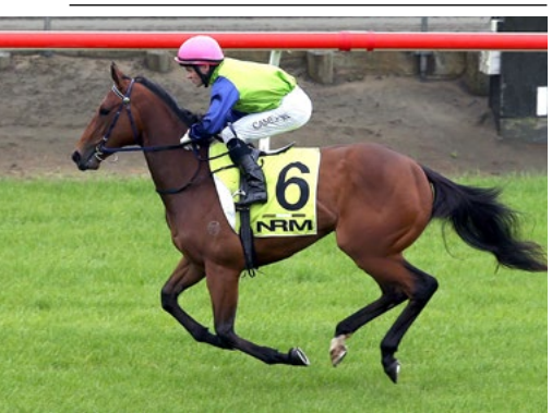
Juliette (NZ) (Poet's Voice)

"I've ridden Aide Memoire once for a Listed win in the Rangitikei Cup and she's gone on with it since then. She's probably not the better horse today, but she probably will be next year." Full story here.