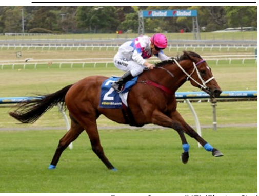
Famous Seamus (NZ) (Elusive City)

Gift Of Power (NZ) (Power), who is unbeaten in two starts culminating in her Listed Wellesley Stakes win at Trentham, opened as the $1.95 favourite, head of Ruakaka debut winner Melody Belle (NZ) (Commands).