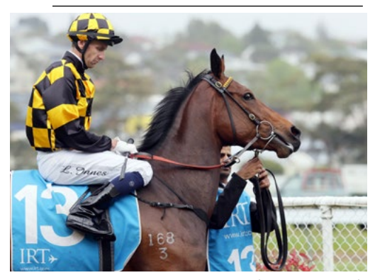
Orphea (Fastnet Rock)

Fellow New Zealand bred contender Prince Famous (NZ) (Fast 'n' Famous) fared better in the draw and will start from gate five.