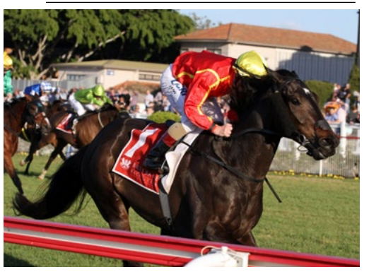
Iggi Pop (NZ) (Savabeel)

Last start winner Infantry (NZ) (Tavistock) and Bring Money Home (NZ) (Mr Nancho) will also contest the race, with Group Three winners El Padrino (NZ) (Mr Nancho) and Daniel (NZ) (Guillotine) completing the kiwibred contingent.