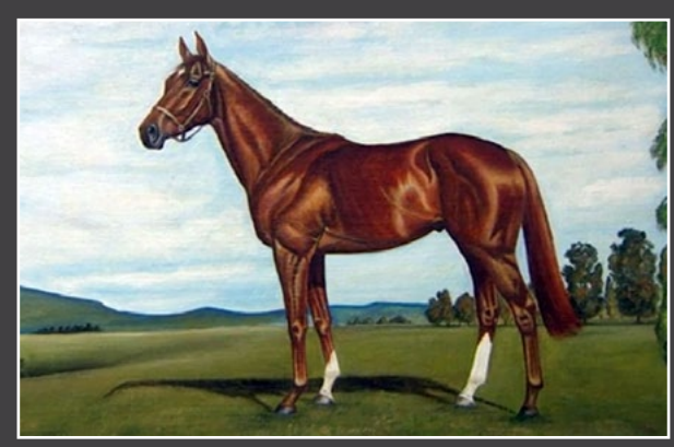
CLICK TO PLAY