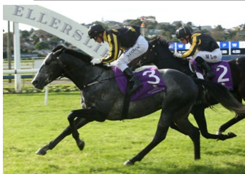
Battle Time (NZ) (Battle Paint)