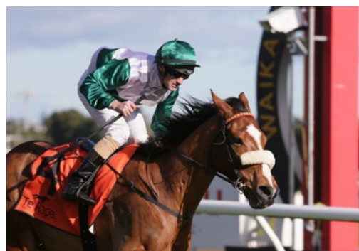
Southern Icon (Big Brown)