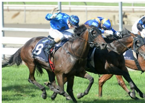
Endean Rose (NZ) (Savabeel)