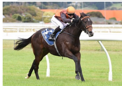
Dance For Money (NZ) (Showcasing)