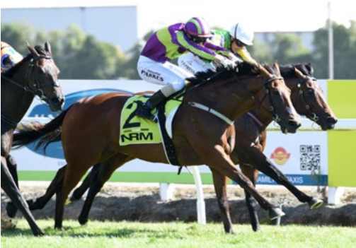
Start Wondering (NZ) (Eighth Wonder)

Mighty Solomon, who has placed at Group One level, got home well at his most recent appearance at Awapuni for a close second behind Shadow Fox (NZ) (Keeninsky). He meets that runner a kilo and a-half better off today.