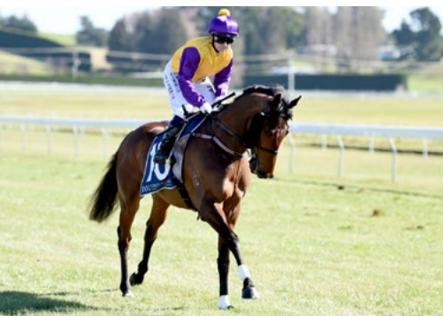
Mofara (NZ) (Iffraaj)