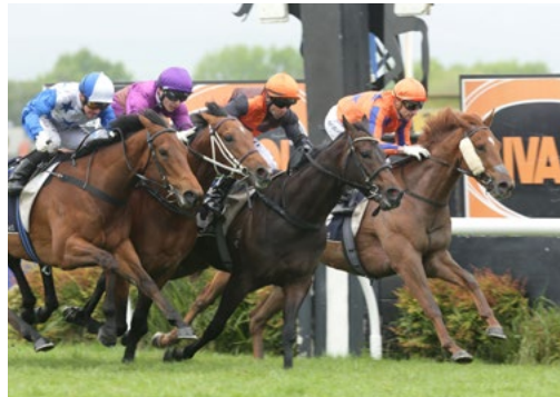
Hard Merchandize (NZ) (Burgundy)

"She really needs the sting out of the ground and is better in the autumn. We'll just keep her ticking over and aim for then."