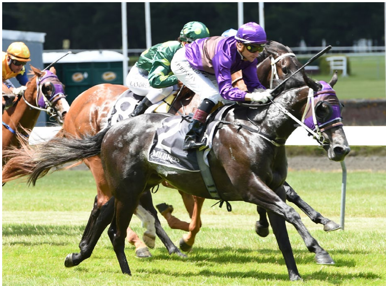
Platinum Volos makes his debut in stakes company in the Gr.3 Lucia Valentina Wellington Stakes (1600m)