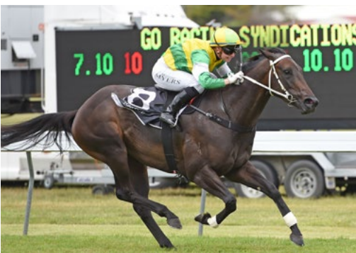
Akoya (NZ) (Bullbars)

It was Sacred Star's second trials outing since he last raced and he showed improvement on his unplaced trials effort at Cambridge earlier this month. Full story here