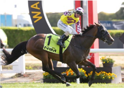
Sacred Star (Flying Spur)

Sacred Star hasn't raced since a three-start Queensland Winter Carnival campaign 16 months ago, but he proved at Tuesday's Matamata trials that he had lost none of his talent.