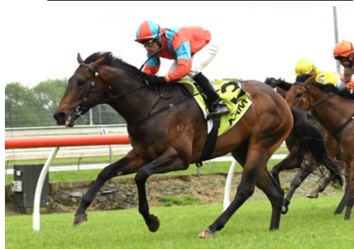
Demonetization (All Too Hard)

Logan's 2012 winner Habibi (NZ) (Ekraar) went on to win the New Zealand Derby later that season, while her 2013 winner Rising Romance (NZ) (Ekraar) was second in the Derby before winning the Gr.1 Australian Oaks (2400m) at Randwick, then later finished second in the Gr.1 Caulfield Cup (2400m). Full story here