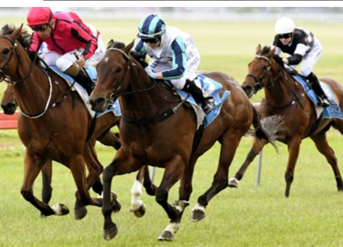
Polzeath (NZ) (Pentire)

The Murdochs had earlier been successful with Polzeath (NZ) (Pentire) and Pokuru Nugget (NZ) (Stravinsky).