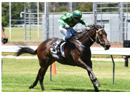
Gift Of Power (NZ) (Power)

Gift Of Power disputed most of the pace with Break My Stride (Zoffany) and she pleased the Tuhikaramea trainer with her fighting second, a head behind