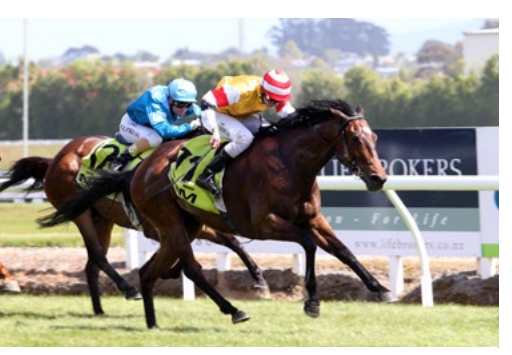
Stolen Dance (NZ) (Alamosa)