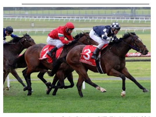
Awake In Grinzing (NZ) (Rip Van Winkle)