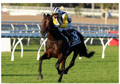
Provocative (NZ) (Zabeel)

Provocative (NZ) (Zabeel) needs a strong tempo to be considered a genuine winning chance in the Listed Heatherlie Stakes