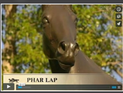
CLICK TO PLAY