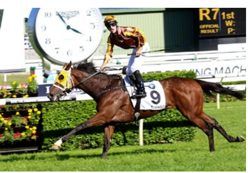
Tavago (NZ) (Tavistock)