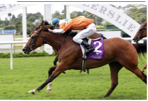
Rising Romance (NZ) (Ekraar)

"It's a bit of an unknown taking on the older horses for the first time, but we're happy with the horse."