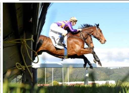
Sea King (NZ) (Shinko King)

"It's a very good field, but with all the rain we've had the track will affect others more than us – she'll cop it okay."