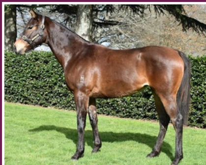
PINS FILLY. HALF SISTER TO GR.1 WINNER THEE AULD FLOOZIE.