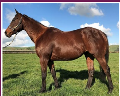
BLACK-TYPE MARE IN FOAL TO DALGHAR.