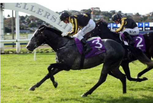
Battle Time (NZ) (Battle Paint)