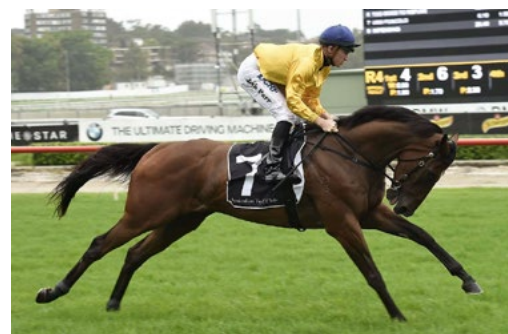
Ugo Foscolo (NZ) (Zacinto)