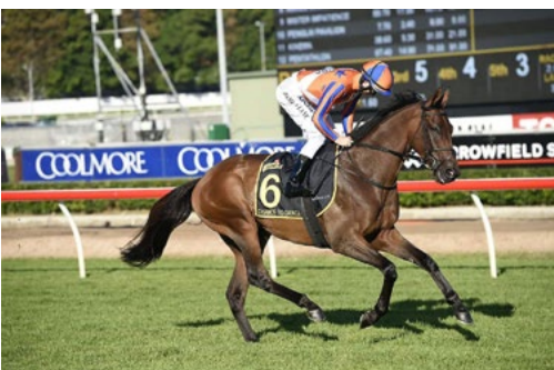
Chance To Dance (Teofilo)