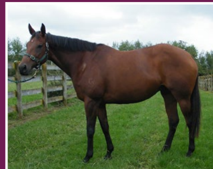
WELL-RELATED ELUSIVE CITY MARE IN FOAL TO FERLAX.