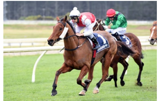
Rocstock (NZ) (Tavistock)

The pair are unbeaten in two starts after Rocstock followed up his debut success with a tidy win in the Christmas at the Races