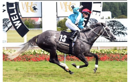
Thee Auld Floozie (NZ) (Mastercraftsman)