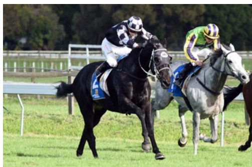
Five To Midnight (NZ) (Domesday)

"After two trials, he will resume over 1600 metres and then head to the Gr.1 Livamol Classic at Hastings on October 7 where a good strong performance could see him head to Melbourne to contest the Caulfield Cup."