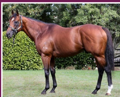
NOMINATION TO SUPER EASY .