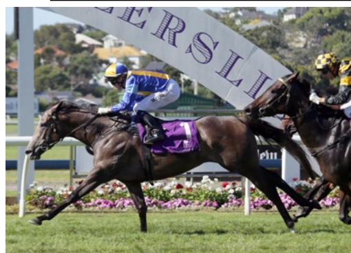
Mime (NZ) (Mastercraftsman)