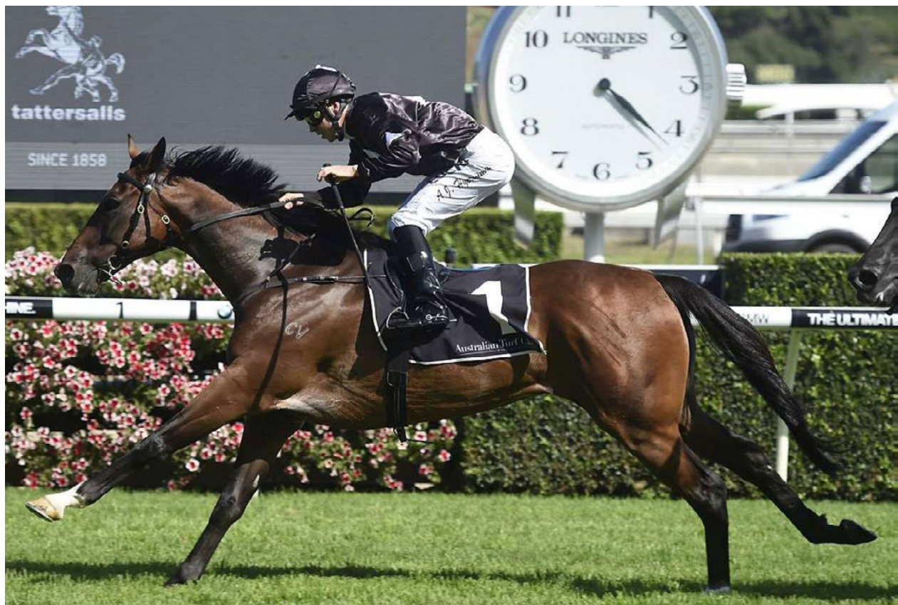
Ecuador will tackle the mighty Winx in his first-up run at Randwick on Saturday