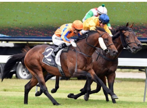
Hall Of Fame (NZ) (Savabeel)