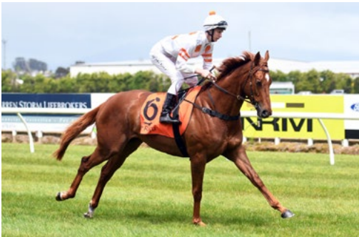
Astor (NZ) (Iffraaj)