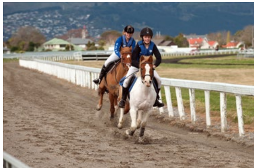
Ride To Time

Out of the stakes-performed Storm Cat mare Forest Native, she is an unnamed sister to the Gr.1 William Reid Stakes winner and Group One producer Foxwedge. Full story here