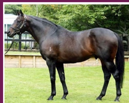
NOMINATION TO SHOCKING.

Featuring 26 Lots including five yearlings, three two-year-olds, five unraced horses, three raced horses, eight broodmares, and two stallion nominations. Covering sires include Dalghar, Ferlax, and Shamoline Warrior.