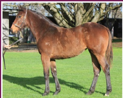
ROCK 'N' POP FILLY. HALF SISTER TO SW SEWREEL.