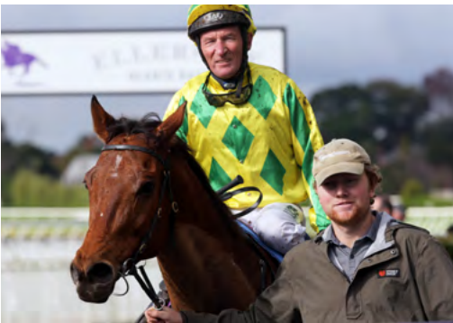
Close Up (NZ) (Shinko King)

when the pair meet in the Gr.2 Lisa Chittick Foxbridge Plate (1200m) at Te Rapa.