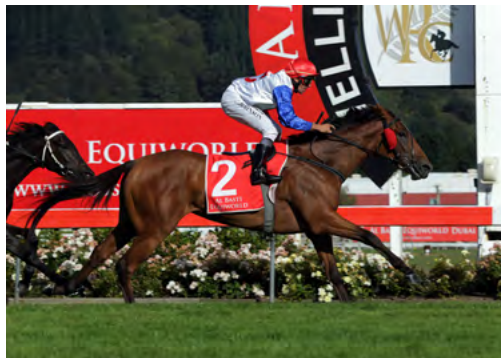
Savvy Coup (NZ) (Savabeel)

The son of War Front won three of his 11 career starts, including the Gr.2 Vintage Stakes (1400m) and Gr.3 Diamond Stakes (2149m).