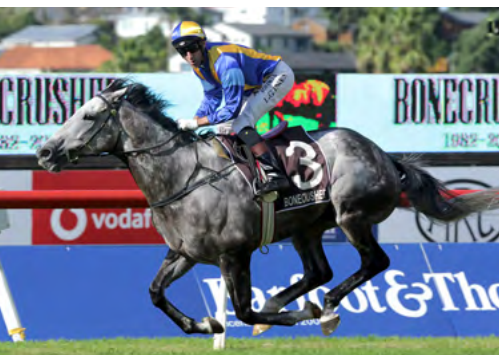
Saint Emilion (NZ) (Mastercraftsman)

She carried on with top form before returning to Sydney to win the Gr.1 ATC Oaks (2400m) after being relegated from first in the Gr.1 New Zealand Oaks (2400m) at Trentham.