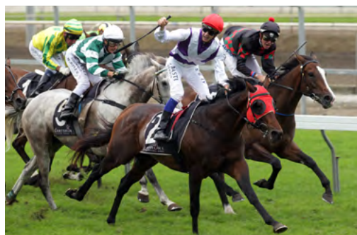
Ocean Emperor (NZ) (Zabeel)

she was a bit big in condition. Full story here