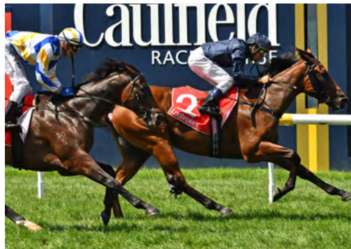
Long Leaf (Fastnet Rock)