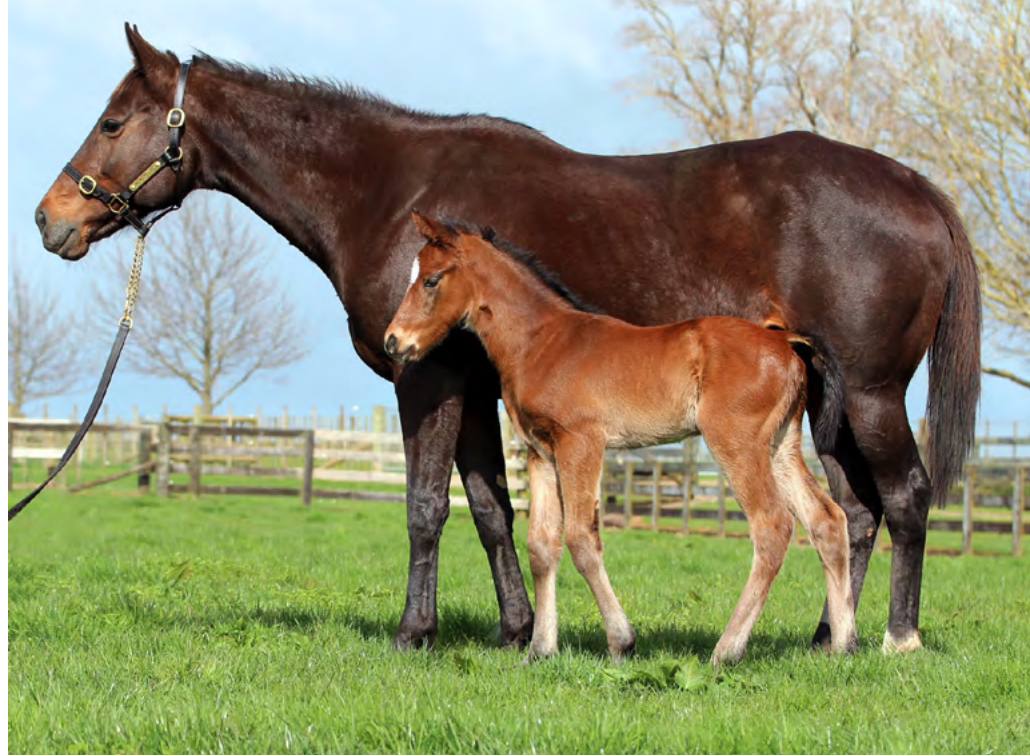
Tivaci – Lego colt

Lego's pedigree also features the Gr.1 New Zealand 2000 Guineas winner Xtravagant (NZ) (Pentire), Gr.1 WATC Derby winner Guyno (NZ) (O'Reilly) and the Gr.1 Arrowfield Stud Stakes heroine Sixty Seconds (NZ) (Centaine).