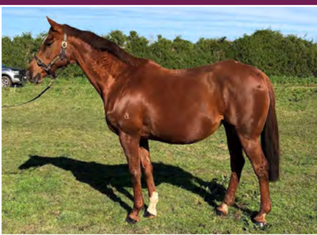
DAM OF THE JUSTICE LEAGUE, IN FOAL TO TURN ME LOOSE.