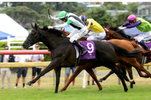
Stella Noire (NZ) (Showcasing)

Ocean Emperor, a seven-year-old son of Zabeel, will resume in the Gr.1 Tazirino Trophy (1400m) at Hastings on September 1. It's the same race which Ocean Park won on his unbeaten path to his Cox Plate victory six years ago.