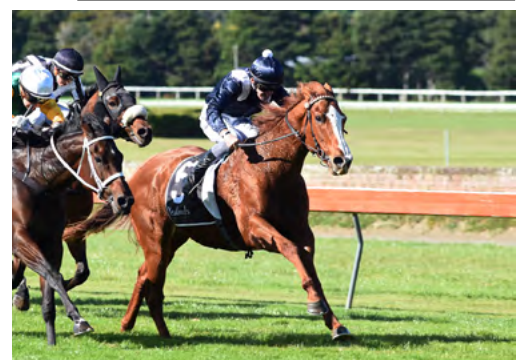
Rayas (NZ) (Rip Van Winkle)

"I've been waiting for a while for a suitable race for him. He won a nice trial last week (August 8) and I expect him to give a decent account of himself, even if it's a strong race."