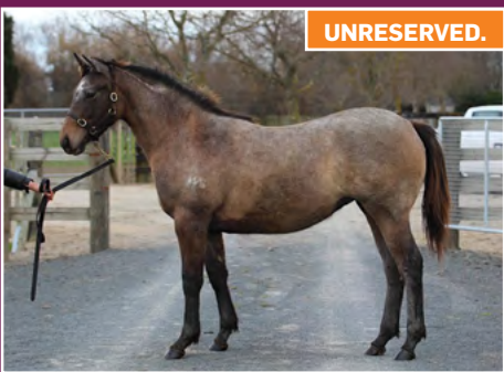
ROCK 'N' POP FILLY OUT OF A WINNING PINS MARE.