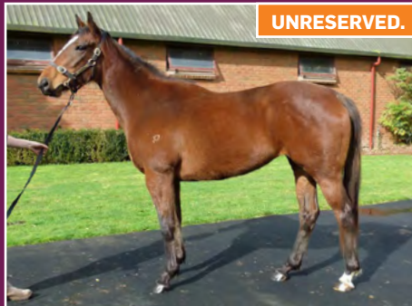
FULL TO A STAKES-WINNER. PEARL SERIES ELIGIBLE.