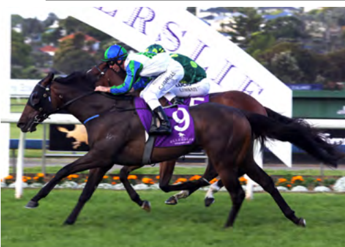
Coldplay (NZ) (Savabeel)

"He has first choice each time they race and this time he's on Close Up."