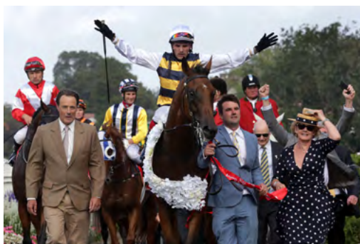
Vin de Dance (NZ) (Roc de Cambes)

Vin De Dance slipped into contention for the Gr.1 A$7.3 million Lexus Melbourne Cup (3200m) at Flemington on November 6 when winning last season's Gr.1 New Zealand Derby (2400m) at Ellerslie before finishing fourth in both the Gr.1 Rosehill Guineas (2000m), when relegated from