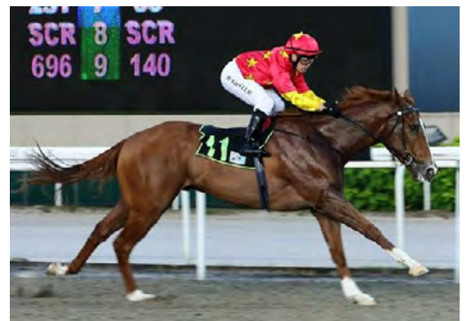
Skywalk (NZ) (Battle Paint)