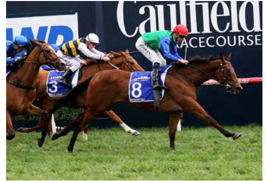
Bonneval (NZ) (Makfi)

The parade will commence at 2pm on September 2 at 100a Threlkelds Road, Ohoka, North Canterbury.