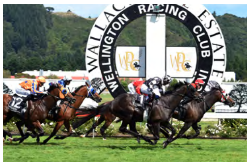
Enzo's Lad (Testa Rossa)

Stella Noire is a daughter of former Haunui Farm shuttle sire Showcasing. The successful stallion was represented by Gr.1 Phoenix Stakes (1200m) winner Advertise in Ireland on Sunday.