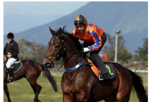
Sword Of Osman (NZ) (Savabeel)

Bonneval's countdown to another Australian campaign was planned to commence with a trial at Avondale on Tuesday, and the multiple Group One