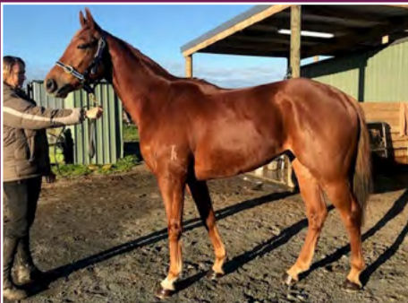
WINNING BULLBARS GELDING. IN FULL WORK.

Youngsters, racing stock and broodmares with covering sires including Burgundy, Preferment, Rip Van Winkle, Shocking, Sweynesse, Tivaci, Turn Me Loose, Vadamos and Zed plus two stallion nominations to Zed.