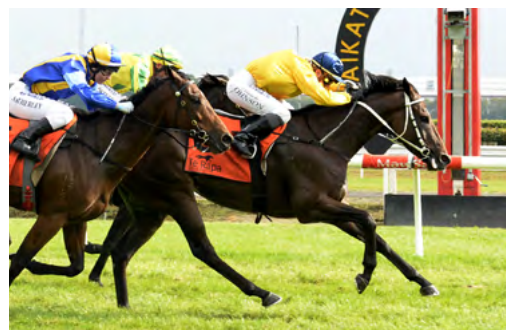
Ugo Foscolo (NZ) (Zacinto)