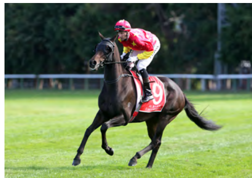
Caricature (NZ) (Power)

"She trialled super and I was surprised how forward she is," Pike said. "She only went over the 840m because I still thought