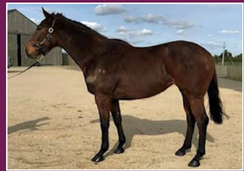
EMPTY SAVABEEL MARE. A HALF TO SHE'S A THIEF.