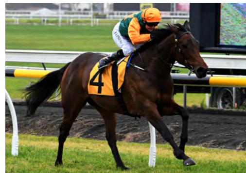
New York Minute (NZ) (Iffraaj)