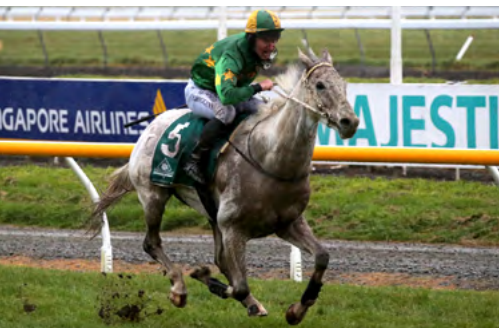
Jackfrost (NZ) (Gallant Guru)