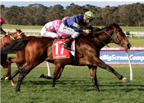
Declarationofheart (Declaration Of War)