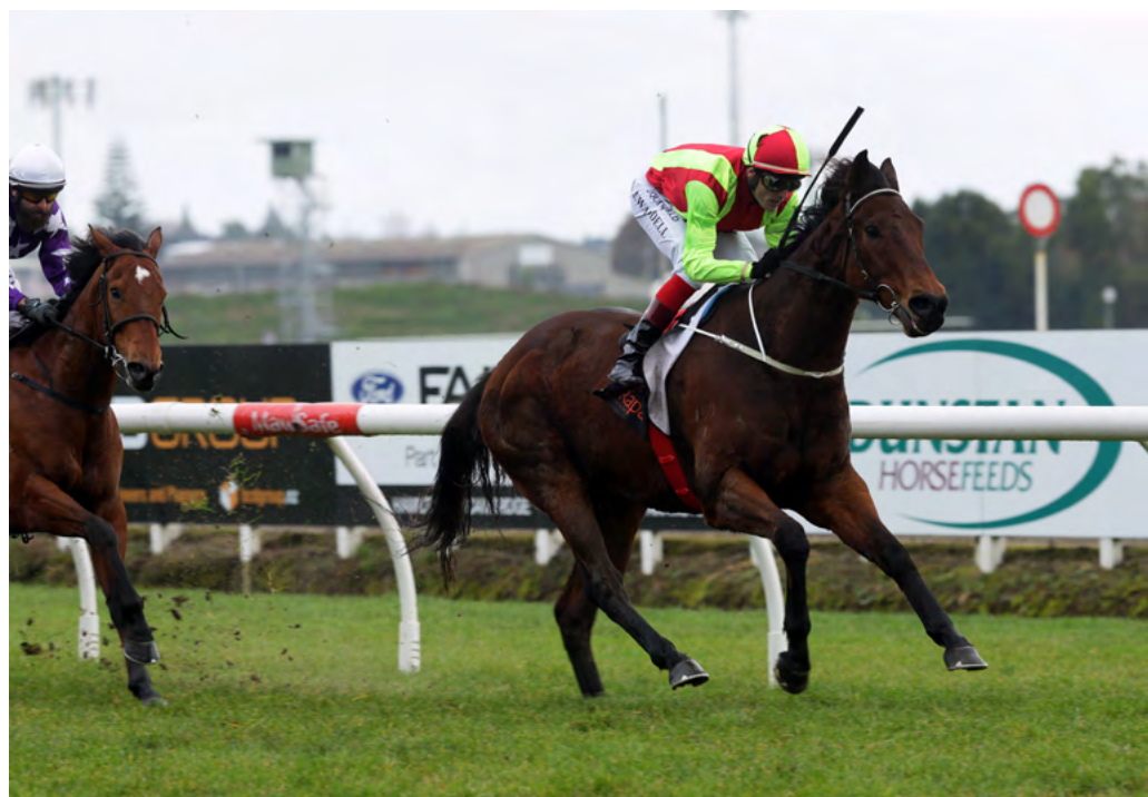
Exciting sprinter Julius faces his biggest test in the Gr.2 Lisa Chittick Foxbridge Plate at Te Rapa tomorrow