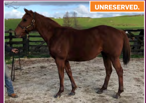
WINNING THORN PARK MARE IN FOAL TO SHOCKING.