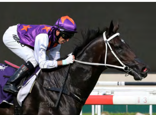
War Affair (NZ) (O'Reilly)