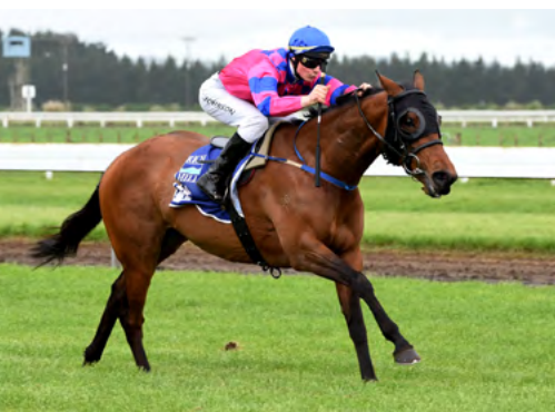
Underthemoonlight (NZ) (El Hermano)

War Affair has earned more than $3 million in prizemoney and is the winner of 12 races, including the $550,000 Patron's Bowl (1600m) and the $550,000 Raffles Cup (1800m). Full story here