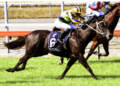
Santa Catarina (NZ) (Savabeel)

set by Group One winner Sofia Rosa (NZ) (Makfi).