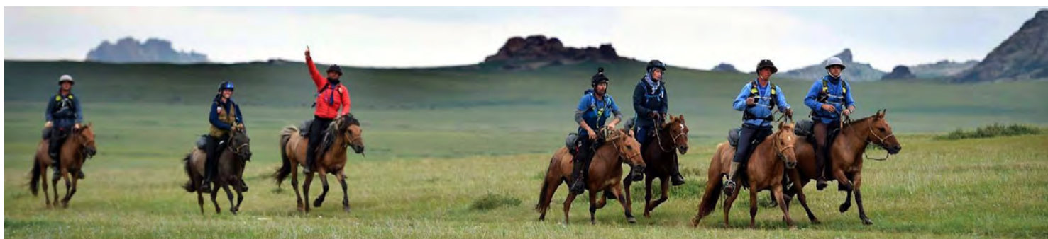
Scenes from the Mongol Derby