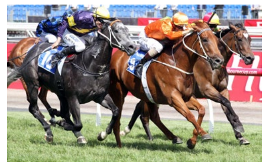
Terravista (Captain Rio)

Xtravagant, who is nominated for the Gr.1 Cox Plate, flew to Melbourne last Wednesday.