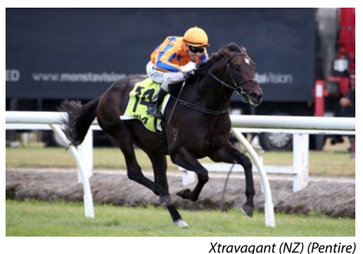
Xtravagant (N2) (

Ideally, the Gr.1 Sir Rupert Clarke Stakes at Caulfield on September 24 would become a realistic target.