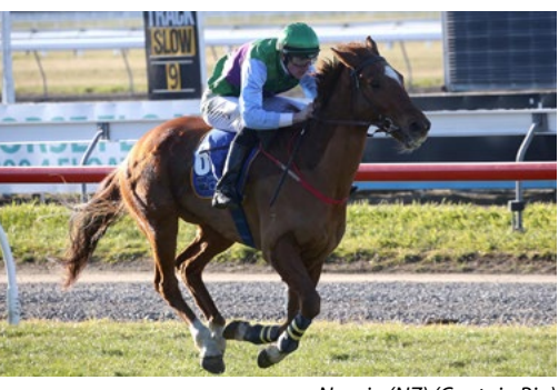
Ngario (NZ) (Captain Rio)

Victory would gain them entry into an elite club as two years ago they triumphed in the Grand National Hurdles. <u>Full story</u> here.