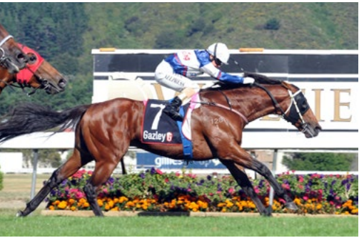
Passing Shot (NZ) (Swiss Ace)

Valley Girl has also been added to the entries for the Caulfield Cup with late entries to close on August 23.