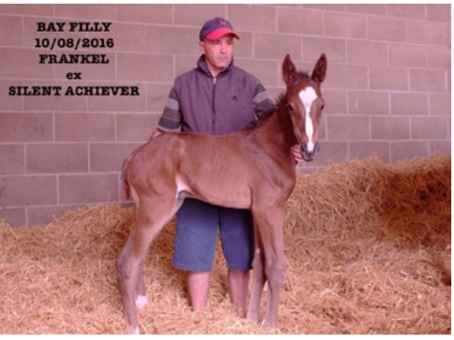
Frankel ex Silent Achiever Filly