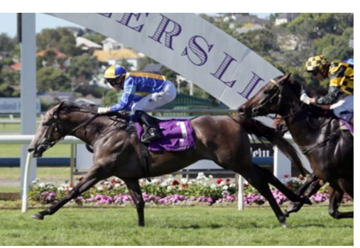
Mime (NZ) (Mastercraftsman)