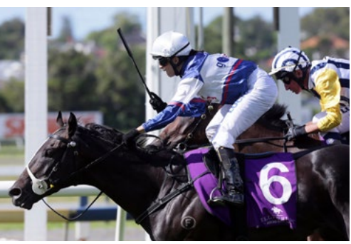
What's The Story (NZ) (Savabeel)

Mime will be a notable first New Zealand race day representative for the powerful China Horse Club, who purchased the Mastercraftsman mare earlier this year. <u>Full</u> story here.