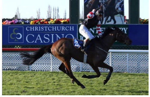
Gargamel (NZ) (Sunray)

The Irishman endured a miserable time on Wednesday when he was brought down off Paddy Owen (NZ) (Patapan) in the maiden hurdle and then parted company with My Magician (NZ) (Remind) in the Grand National Hurdles.