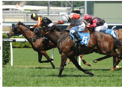
Best Case (NZ) (Savabeel)

bright future and will be suited by 1400 metres in the Golden Rose.