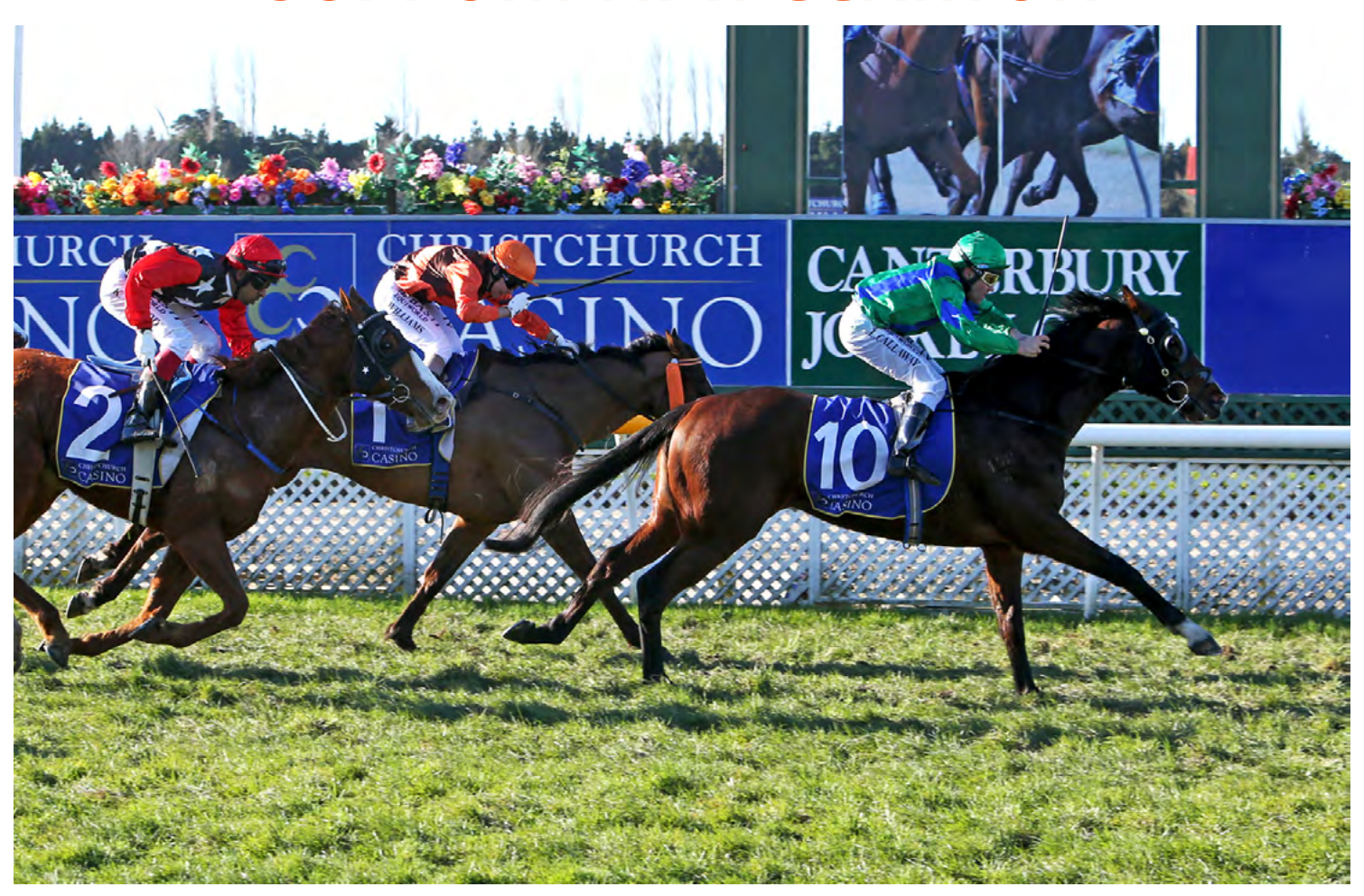
Finbarr adds to a growing reputation with a win at Riccarton

he Gay Robinson-trained Finbarr (NZ) (Falkirk) justified some inspired support when he produced a brave effort to take out the Millennium Hotels & Resorts Premier Open (1400m) at Riccarton.