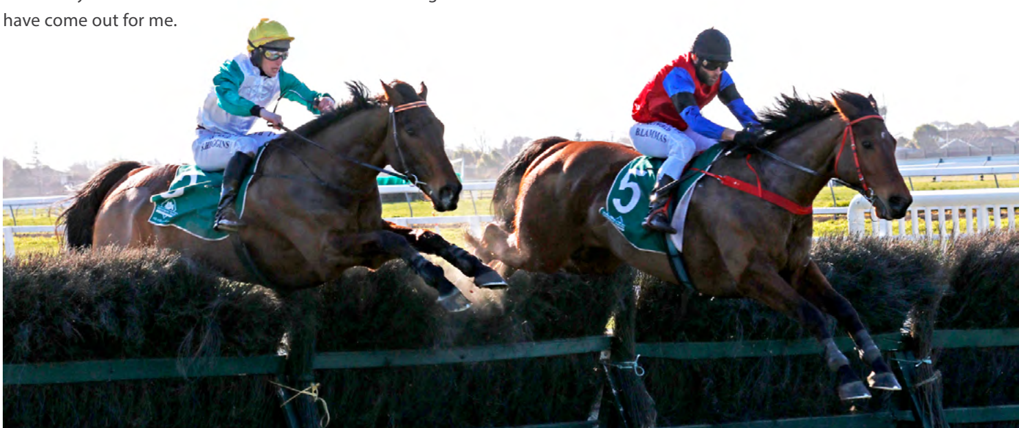
Shamal clears the last fence as eventual runner-up Tai Ho gives chase