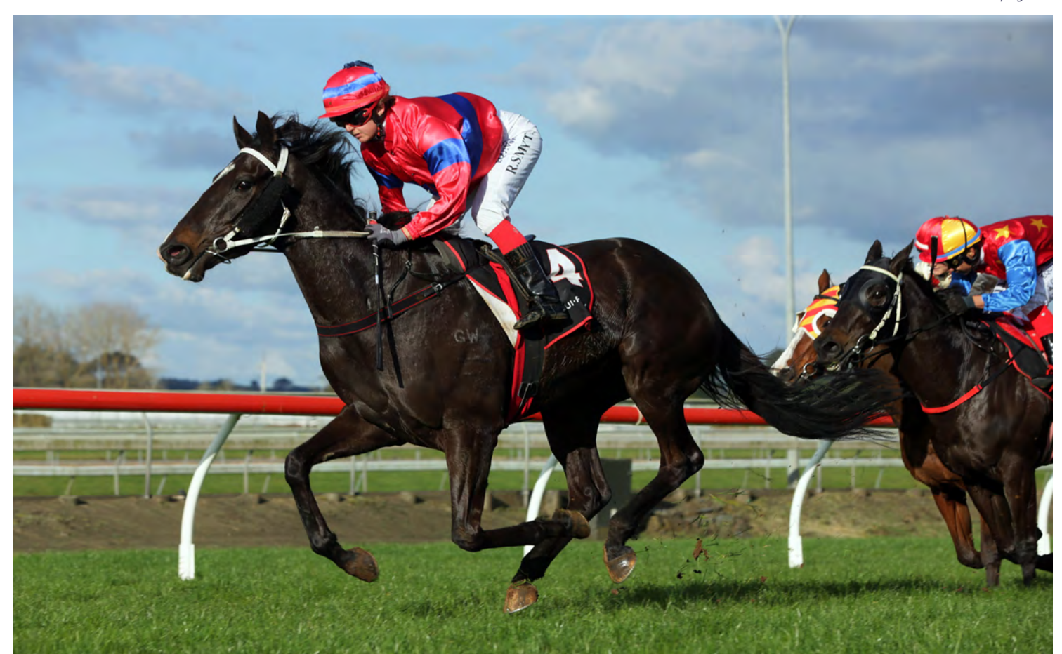
Verry Flash makes it three wins on end with a victory at Pukekohe (Trish Dunell