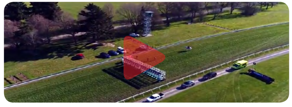
Racing review. (Click image to play)

The Gr.1 New Zealand 2000 Guineas (1600m) winner Hulastrike also features in the pedigree.