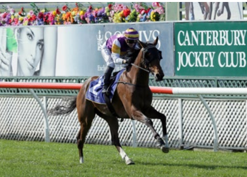
Nymph Monte (NZ) (Tavistock)

The Listed Metropolitan Trophy Handicap winner took a step closer to a new campaign at Waverley on Tuesday when he finished a tidy third in an open 1000m heat.