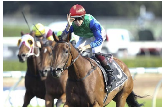
Bonneval (NZ) (Makfi)