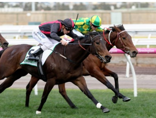
Swampland (NZ) (Redwood)