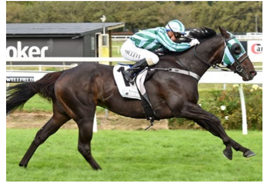
Maybe Miami (NZ) (Iffraaj)