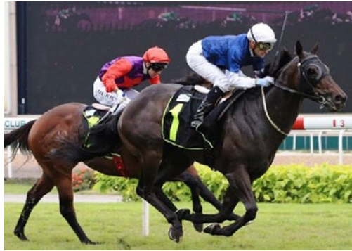
Magnum (NZ) (Per Incanto)

The winner of last season's Gr.3 Eclipse Stakes and runner-up in the Karaka Million, Hasahalo's main target will be the Gr.1 gavelhouse.com 1000 Guineas at Riccarton in November.