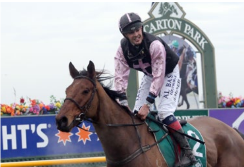
Ready Eddie (NZ) (Yamanin Vital)