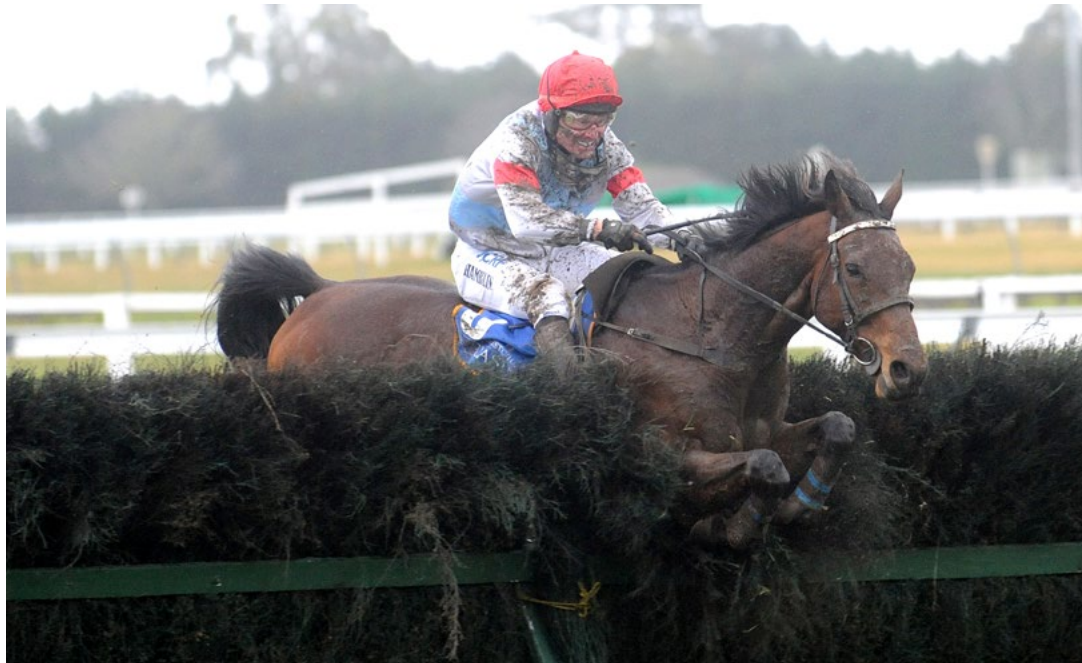
Upper Cut is one of the favoured candidates for tomorrow's Racecourse Hotel & Motor Lodge Grand National Steeplechase at Riccarton