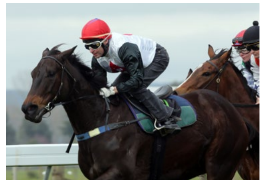
Perfect Fit (NZ) (Elusive City)