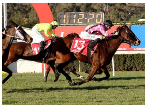
I Boogi (NZ) (Iffraaj)

"He's starting to put it all together now so hopefully this should be his preparation where he stands up, puts his hand up, says that he's there and 'take notice' and hopefully Saturday we start the ball rolling."