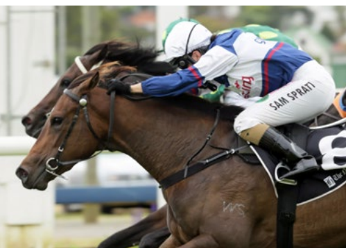
Hasahalo (NZ) (Savabeel)

"He's a pretty clean-winded horse and two runs should have him right for the Group One. We just hope the tracks will be good for him."