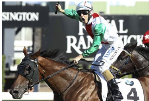
Jon Snow (NZ) (Iffraaj)

The presence of Australia's champion mare makes Moonee Valley a highly unlikely spring destination for a quartet of Group One performers from Cambridge.