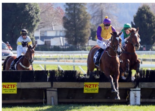
Monarch Chimes (NZ) (Shinko King)