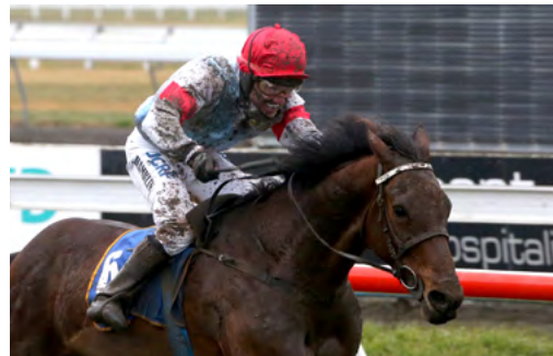
Upper Cut (NZ) (Yamanin Vital)

"He tore the ligaments in his near foreleg and the tendon was hanging on by a few strands," the Awapuni trainer said. Full story here.