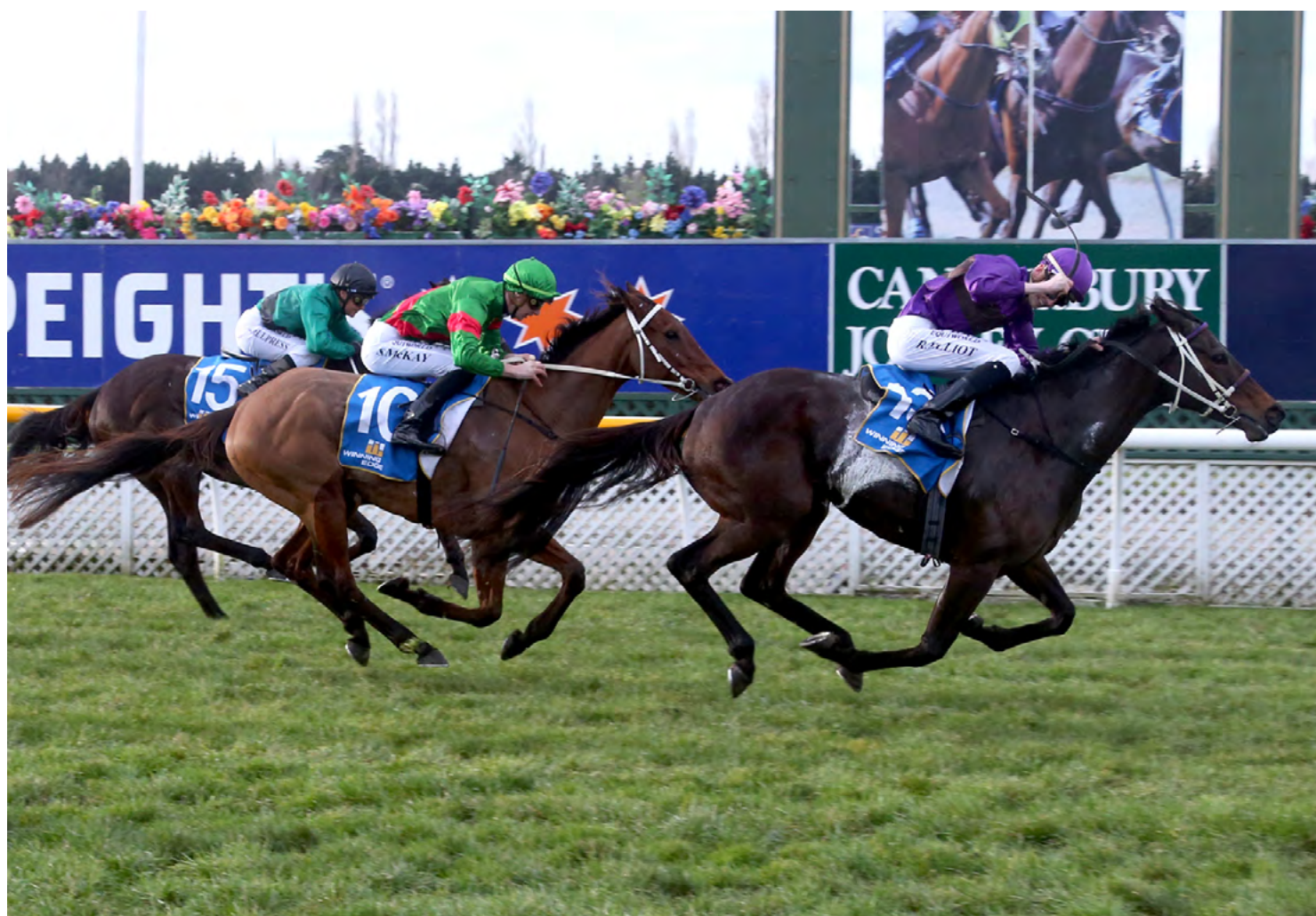
Platinum Command adds the Gr.3 Winter Cup and some valuable black-type to her career record