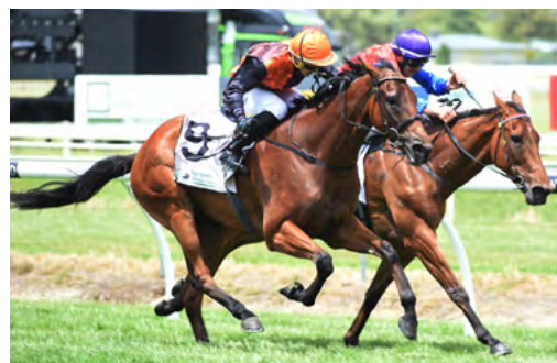
Jacksstar (NZ) (Zed)

"We encourage anyone who hasn't yet planned their day to make sure they come along to the club to take in what is going to be a fantastic day of jumps racing."