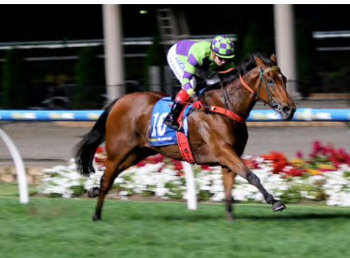
I Am A Star (NZ) (I Am Invincible)