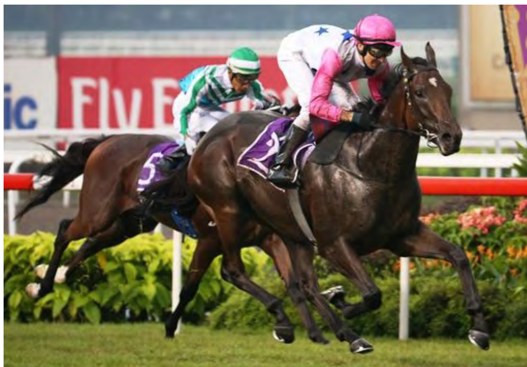
Debt Collector is ready to make his return to the Singapore racing scene