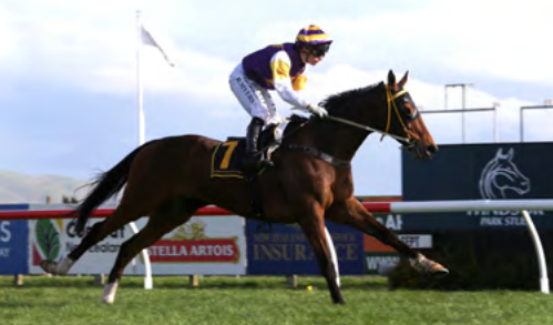
Nymph Monte (NZ) (Tavistock)