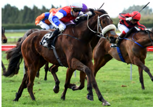
High Quality (NZ) (Handsome Ransom)