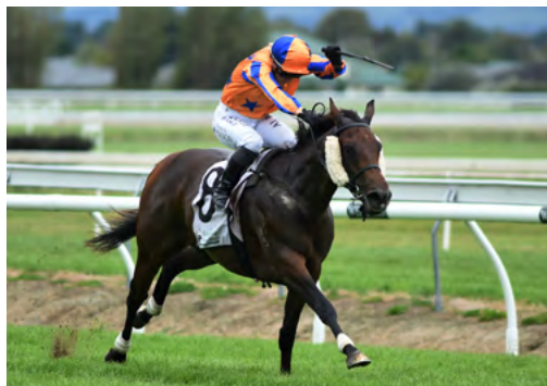
Avantage (Fastnet Rock)