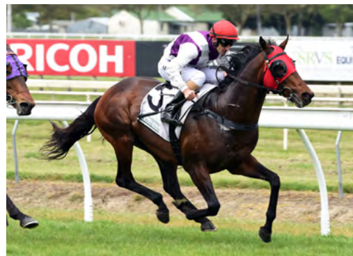
Ocean Emperor (NZ) (Zabeel)

The son of Zabeel was taken to Singapore for the S$1.5 million Kranji Mile (1600m) on May 26 on the strength of his win in the Gr.2 Japan-NZ International Trophy (1600m) at Matamata last March and, though he