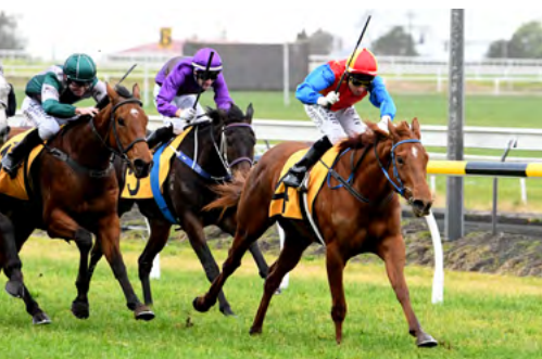
Te Toro Pearl (NZ) (Bullbars)

Nymph Monte was given a trial at Foxton last week and was an eye-catching second to Authentic Paddy (NZ) (Howbaddowantit), finishing strongly over the final stages in his 1000m heat. Full story here