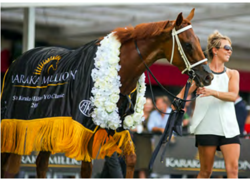
Scott Base (NZ) (Dalghar)