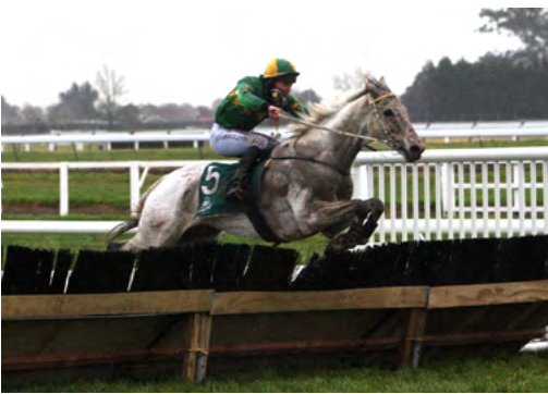
Jackfrost (NZ) (Gallant Guru)

Kings Deep has performed well at past Grand National meetings. The son of Viking Ruler won hurdle races on two days of the 2013 Grand National meeting and was second in the 2015 Grand National Hurdles.