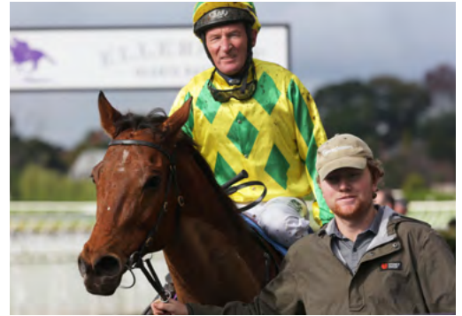
Close Up (NZ) (Shinko King)