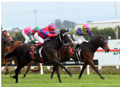
Verry Flash (NZ) (Zed)