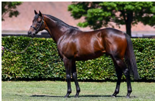
Time Test Time Test was strutting his stuff on screen too ...

Little Avondale Stud's new stallion Time Test (Dubawi) has settled into the Wairarapa lifestyle like a local since his arrival and that temperament was again apparent as he paraded in superb condition for around 60 shareholders and 100 public last Sunday.