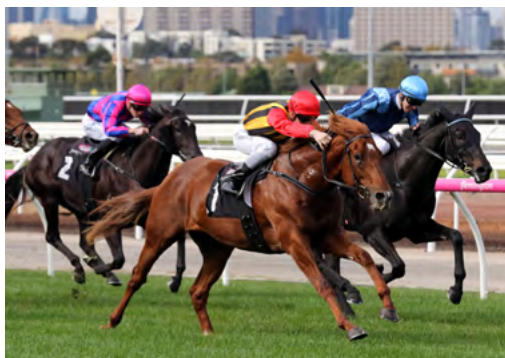
Vassillator (NZ) (Zacinto)