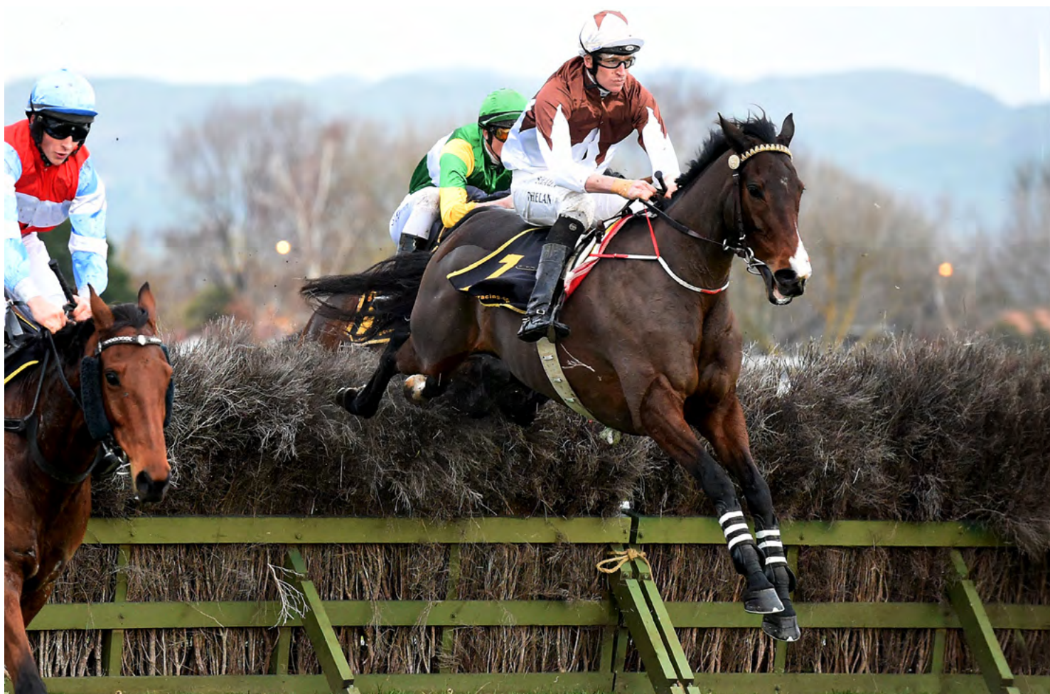
Chocolate Fish looks a leading contender for Saturday's Racecourse Hotel & Motor Lodge Grand National Steeplechase