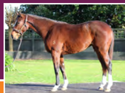
QUALITY SHAMEXPRESS FILLY. RACE OR PIN-HOOK.