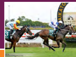
MULTIPLE WINNER BY PENTIRE. RACE OR BREED.

BIDDING CLOSSES FROM 7PM MONDAY 6 AUGUST - REGISTER ONLINE NOW TO BID.