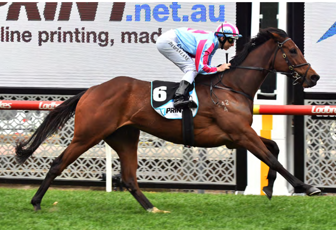
Naantali scores back-to-back wins when successful at Moonee Valley (Quentin Lang)