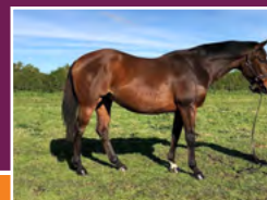
WINNING IMPORT IN FOAL TO RELIABLE MAN.