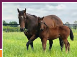
WINNER & DAM OF WINNERS IN FOAL TO OCEAN PARK.