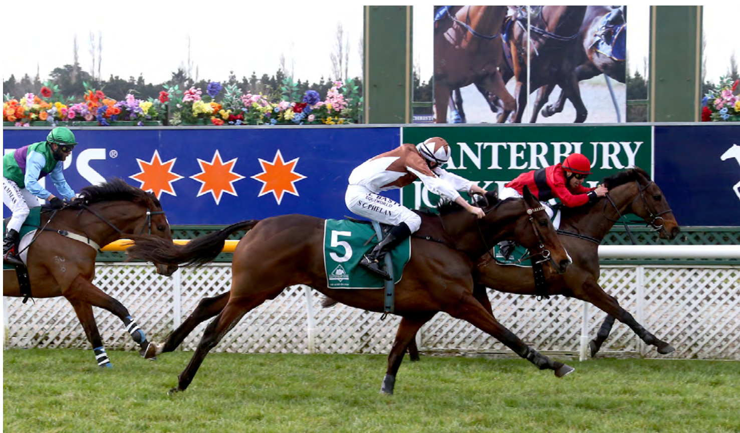
Amanood Lad (rails) defeats Chocolate Fish in the NZI Koral Steeplechase (4250m)