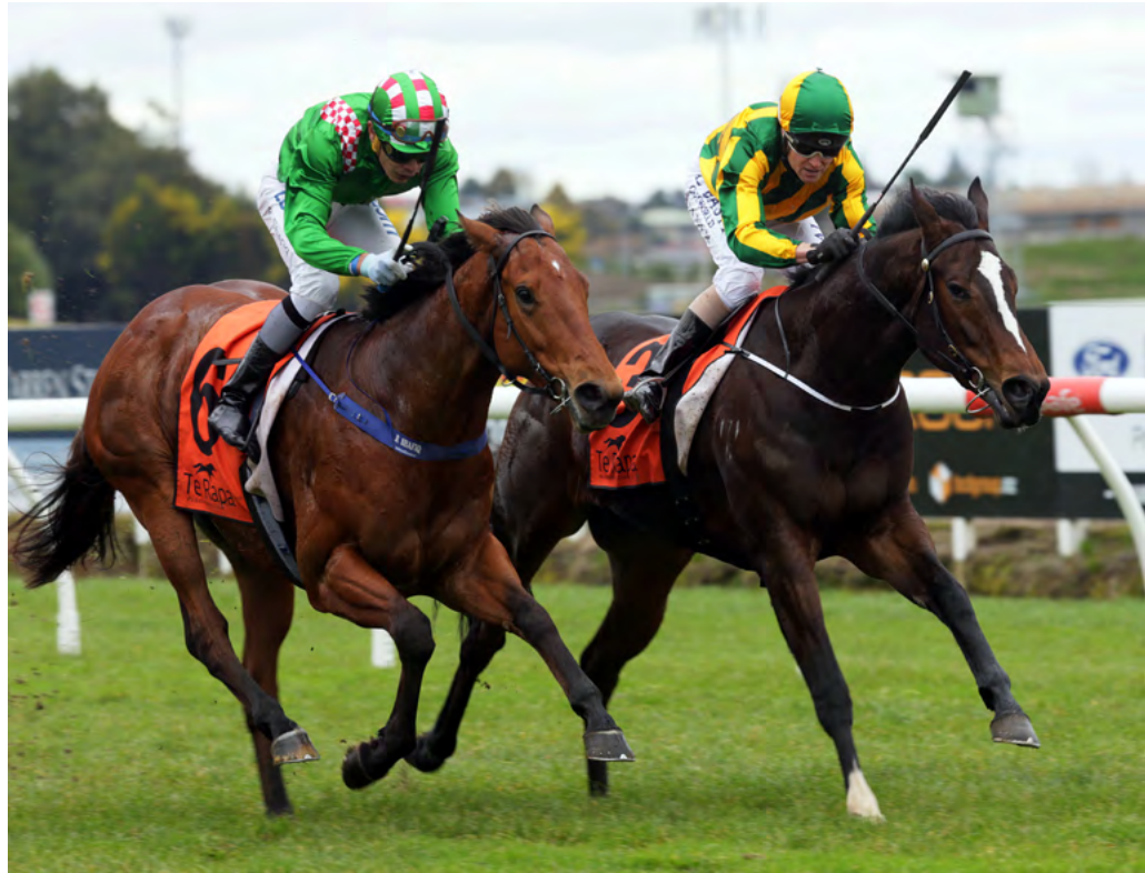
Tiny Terror (closest to camera) was promoted to first over Von Trapp following a successful protest (Trish Dunell)

A passionate racing man, Whitby is a friend to many in the racing industry on both sides of the Tasman.