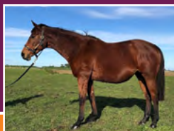
AUSSIE STAKES PLACED MARE IN FOAL TO PREFERMENT.