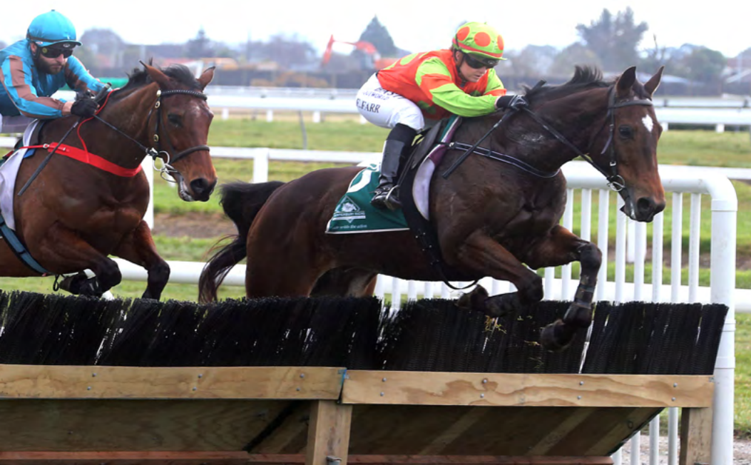
Northern raider Laekeeper en route to winning the Sydenham Hurdles (3100m) at Riccarton on Saturday.