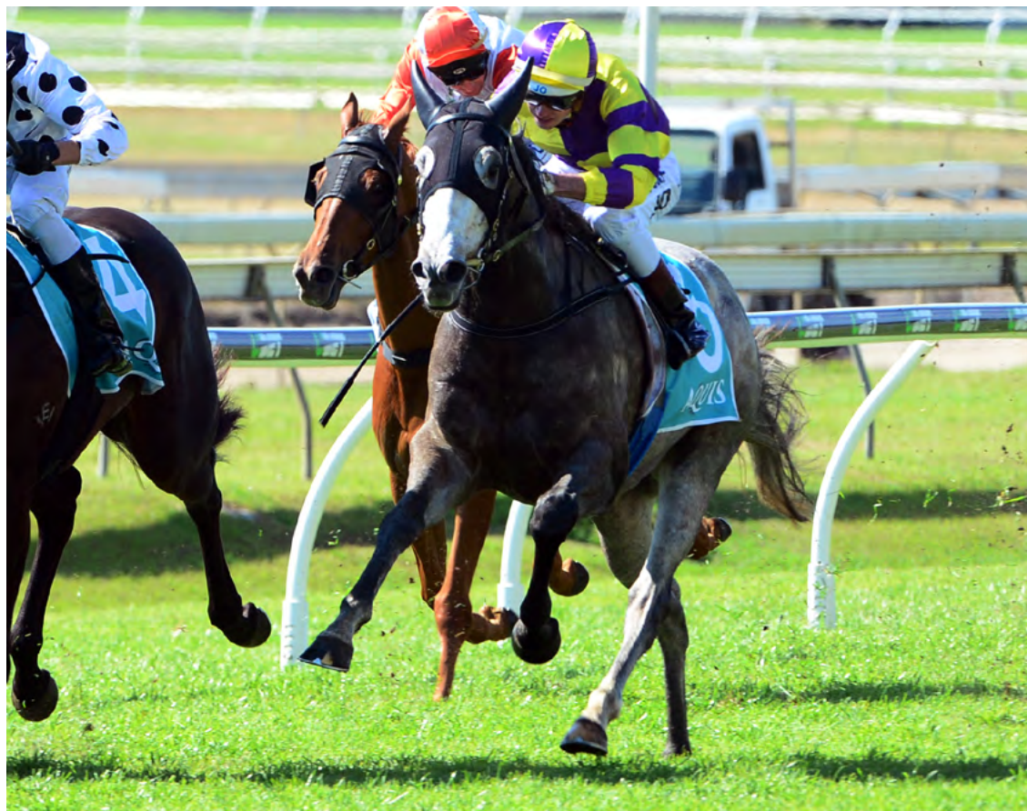
Kiwi bred Trusty Lad scores at Doomben