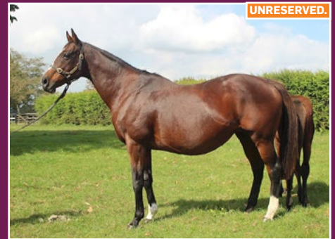
2 IN 1 LOT. MONTJEU MARE WITH A MONGOLIAN KHAN FILLY AT FOOT.