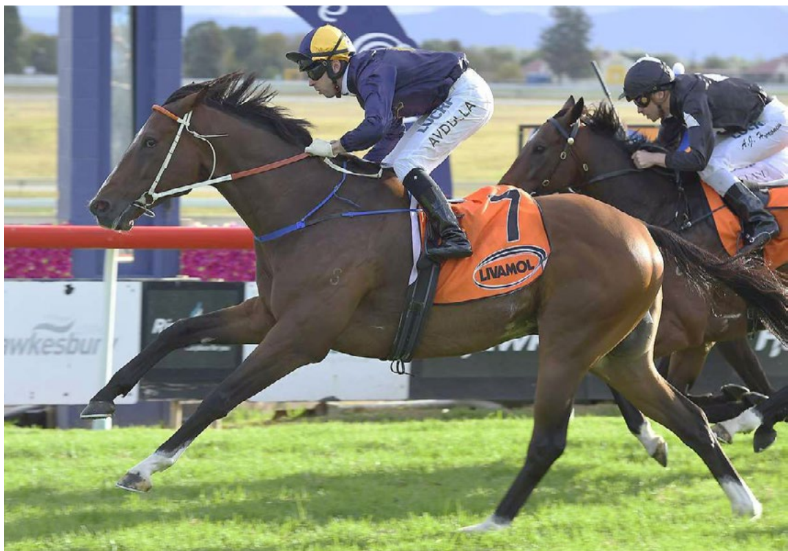
Kingsguard led home a kiwi-bred quinella in the Gr.3 Hawkesbury Gold Cup