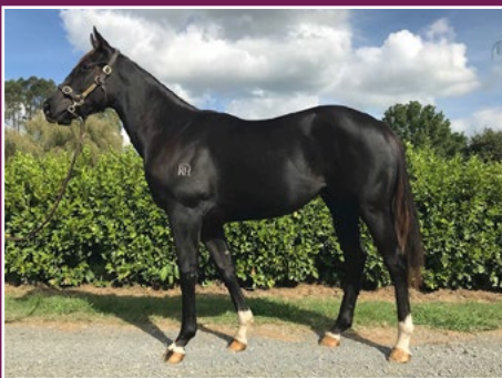
ATTRACTIVE PROISIR COLT OUT OF A DUAL WINNER.