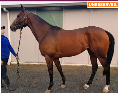
WINNING FILLY BY PER INCANTO. RACE OR BREED.