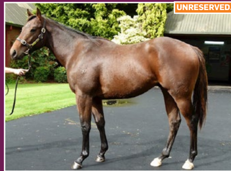
ROC DE CAMBES COLT. CLOSE RELATION TO SEACHANGE, KEEP A CRUISIN.