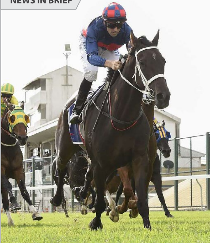
Up 'n' Rolling