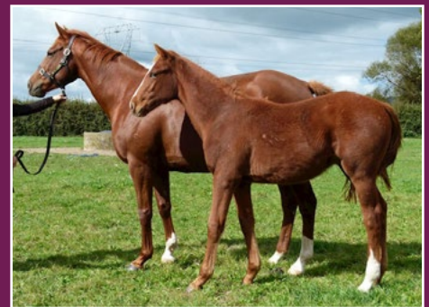
3 IN 1 LOT. MARE IN FOAL TO MONGOLIAN KHAN WITH RIP VAN WINKLE COLT AT FOOT.