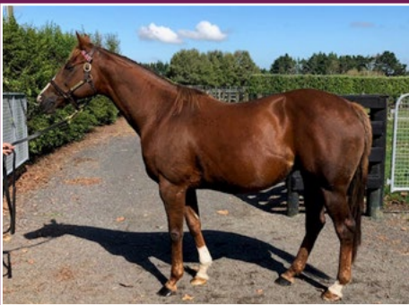
IMPORTED STAKES WINNER CARRYING A RELIABLE MAN COLT.

Featuring 60 Lots including weanlings, yearlings, tried and untried racing stock, broodmares and a Reliable Man share.