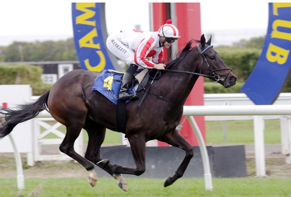
Star Performance kicked his career off in style at Te Rapa