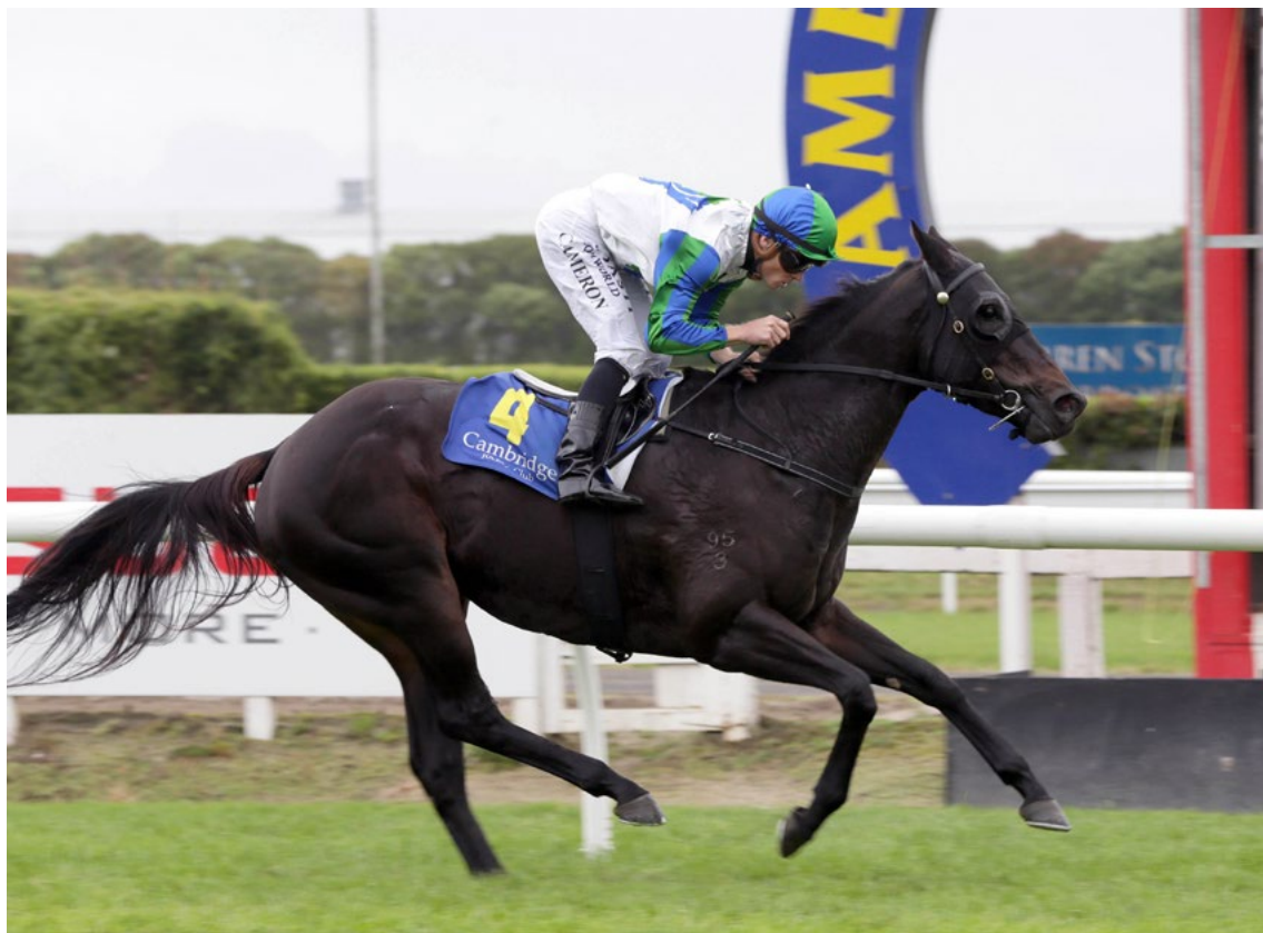
Talented mare Love Affair who impressed when resuming at Te Rapa

but she jumped and got into a good position and kicked really well," he said.