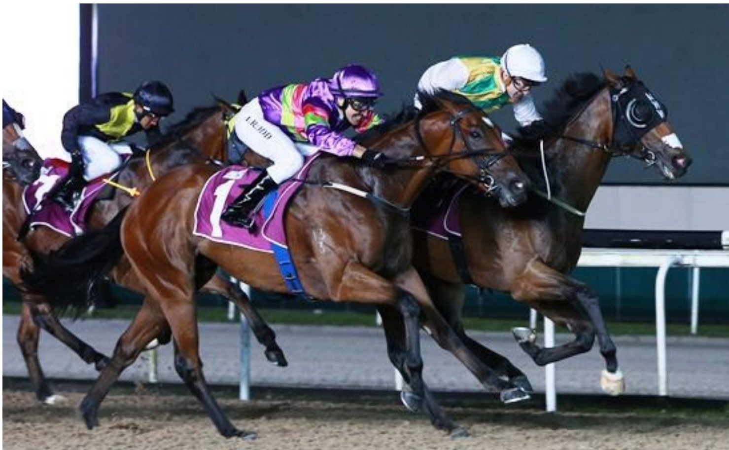
Distinctive Darci (inside) strides past Countofmontecristo to take out the Merlion Trophy