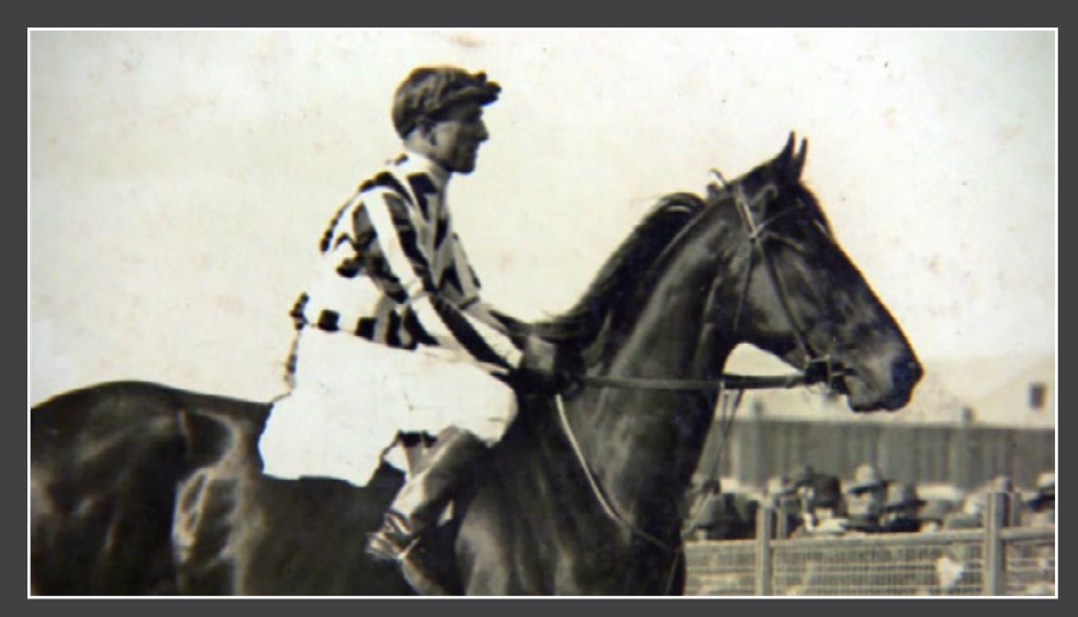
CLICK TO PLAY

Delta, Todman and Wenona Girl were among the champion horses he trained.