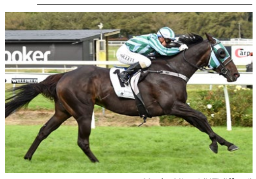
Maybe Miami (NZ) (Iffraaj)