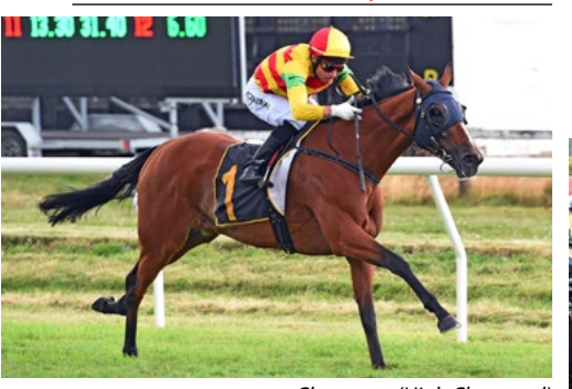
Charmont (High Chaparral)