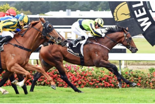
Saracino (NZ) (Per Incanto)

"He's getting there, but we were still not 100 percent happy with him and decided that Brisbane would come up too quickly. Full story here.