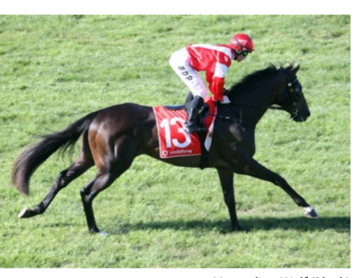
Mongolian Wolf (Pluck)