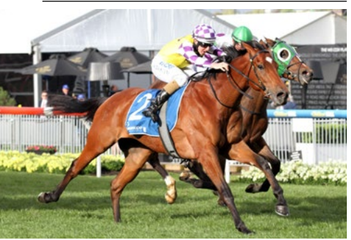
Sacred Elixir (NZ) (Pour Moi)

To add further gloss, barely 10 minutes later close relation Bonneval (NZ) (Makfi) added the Gr.1 ATC Oaks to her Gr.1 New Zealand Oaks success. The Makfi filly is a daughter of the fine broodmare Imposingly, a three-quarter sister to multiple Group One winner Champagne (NZ) (Zabeel), the grand-dam of Charmont. Full story here.