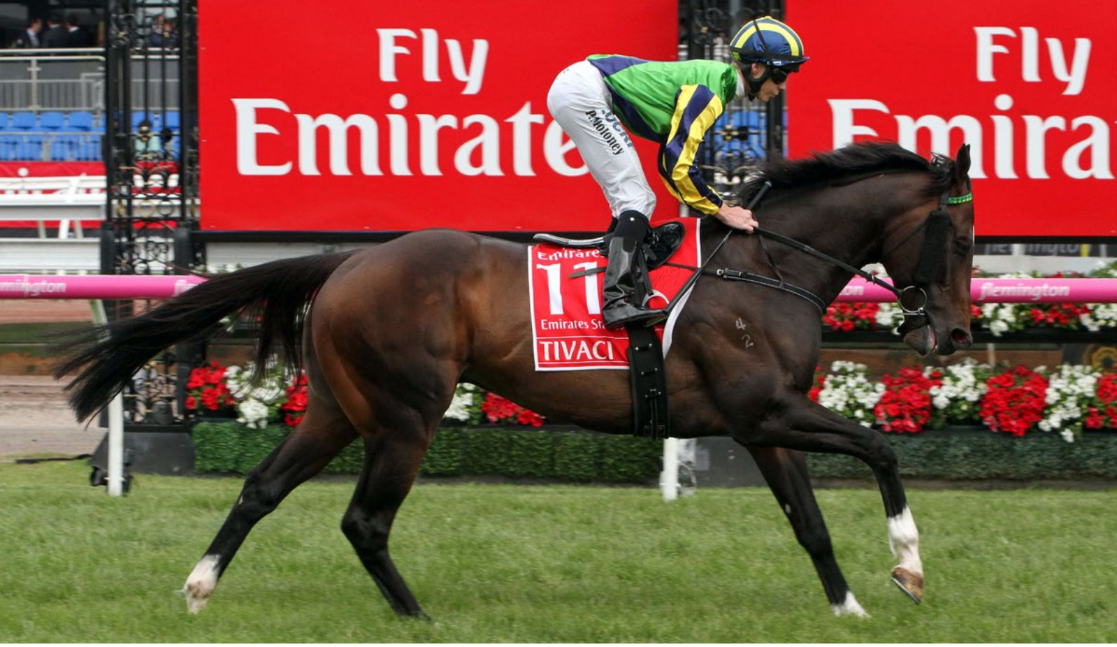
Waikato Stud bound Tivaci will try for a crucial Group One victory at Royal Randwick tomorrow

he Waikato Stud-bound stallion Tivaci (High Chaparral) will have four further opportunities to break through at Group One level before his retirement to the leading Matamata farm.