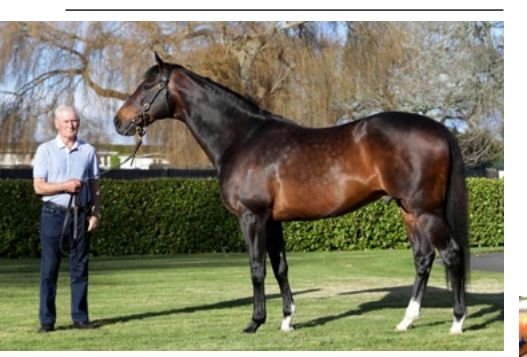
Tavistock (NZ) (Montjeu)

Belardo will stand at Haunui Farm in 2017 for a fee of $12,000 + GST.