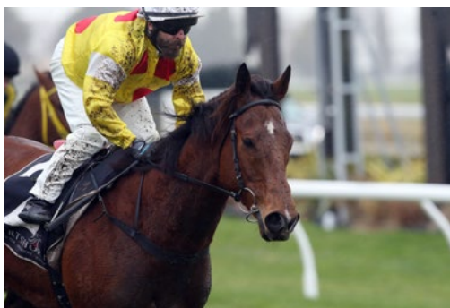
El Pescado (NZ) (El Hermano)

The Tauranga talent went close a couple of times during his last preparation and, following a break, he showed he had come back in good order with a last-start third in the Listed Flying Handicap at Awapuni.