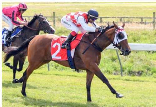
What Choux Want (NZ) (Jimmy Choux)

At $4000 + GST, Group One producer Rios completes the line-up.