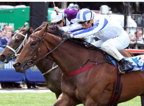
Nurse Kitchen (NZ) (Savabeel)