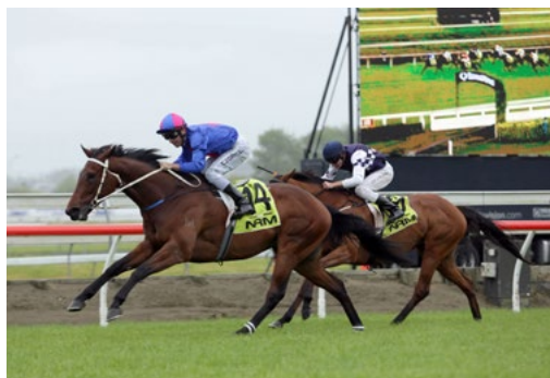
Chocante (NZ) (Shocking)

"This time in she trialled well once and a little plainly once, so we were a little unsure going into her first start. But we were confident once she put the score on the board on debut."