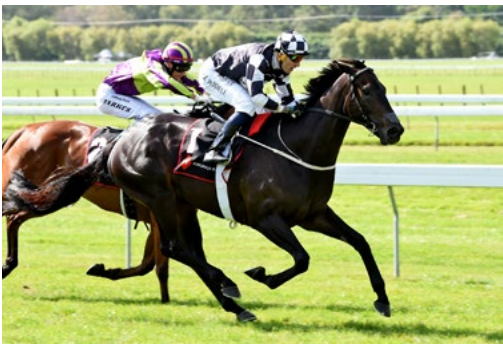
Kawi (NZ) (Savabeel)

"He's an explosive sprinter-miler so we'll be keeping him to 1200, 1400 and 1600 metre races."