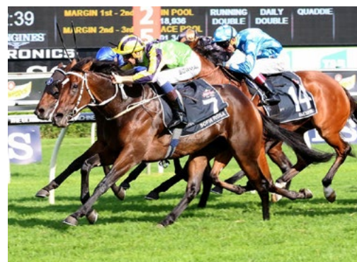
Sofia Rosa (NZ) (Makfi)