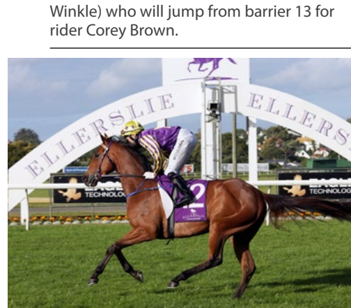
Stylish Attack (NZ) (Tavistock)