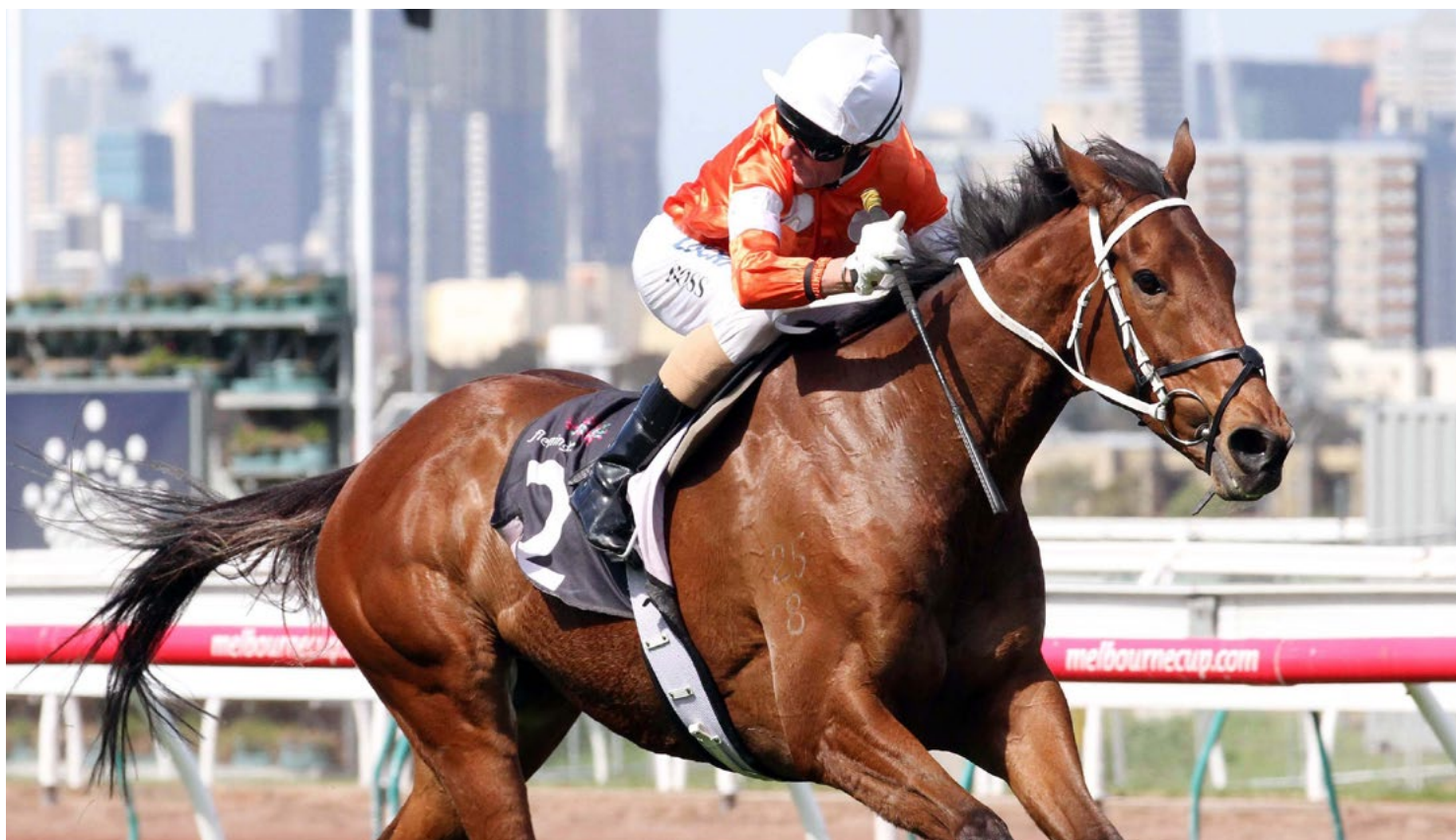
Grand warhorse Who Shot Thebarman lines up for his next 3200m challenge in tomorrow's Gr. 1 Sydney Cup at Royal Randwick