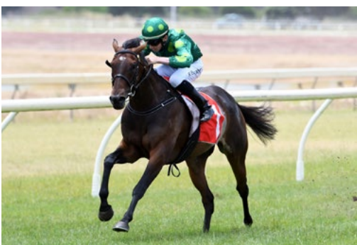
Hiflyer (NZ) (Tavistock)