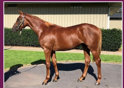
FERLAX COLT OUT OF A WINNING ZABEEL MARE. ON THE MARKET.