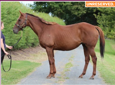
WINNING THORN PARK MARE IN FOAL TO TIVACI & SACRED FALLS FOAL.

Featuring 86 Lots including weanlings, yearlings, racing stock, broodmares, the Gr.1 producing stallion Rios and a share in Reliable Man.