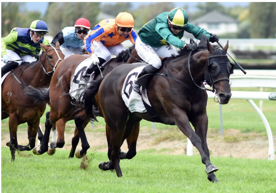
It was a successful NZ homecoming for Magnum who took out the Listed Bramco Granite & Marble Flying Handicap at Awapuni

"It's like he's never been away," she said. "He's got the best temperament in the world, he's the coolest horse to have around and he's got a great mind. We're rapt with him."