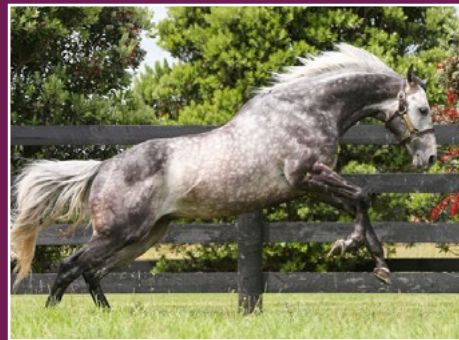
A SHARE IN WESTBURY STUD'S BRILLIANT RELIABLE MAN.