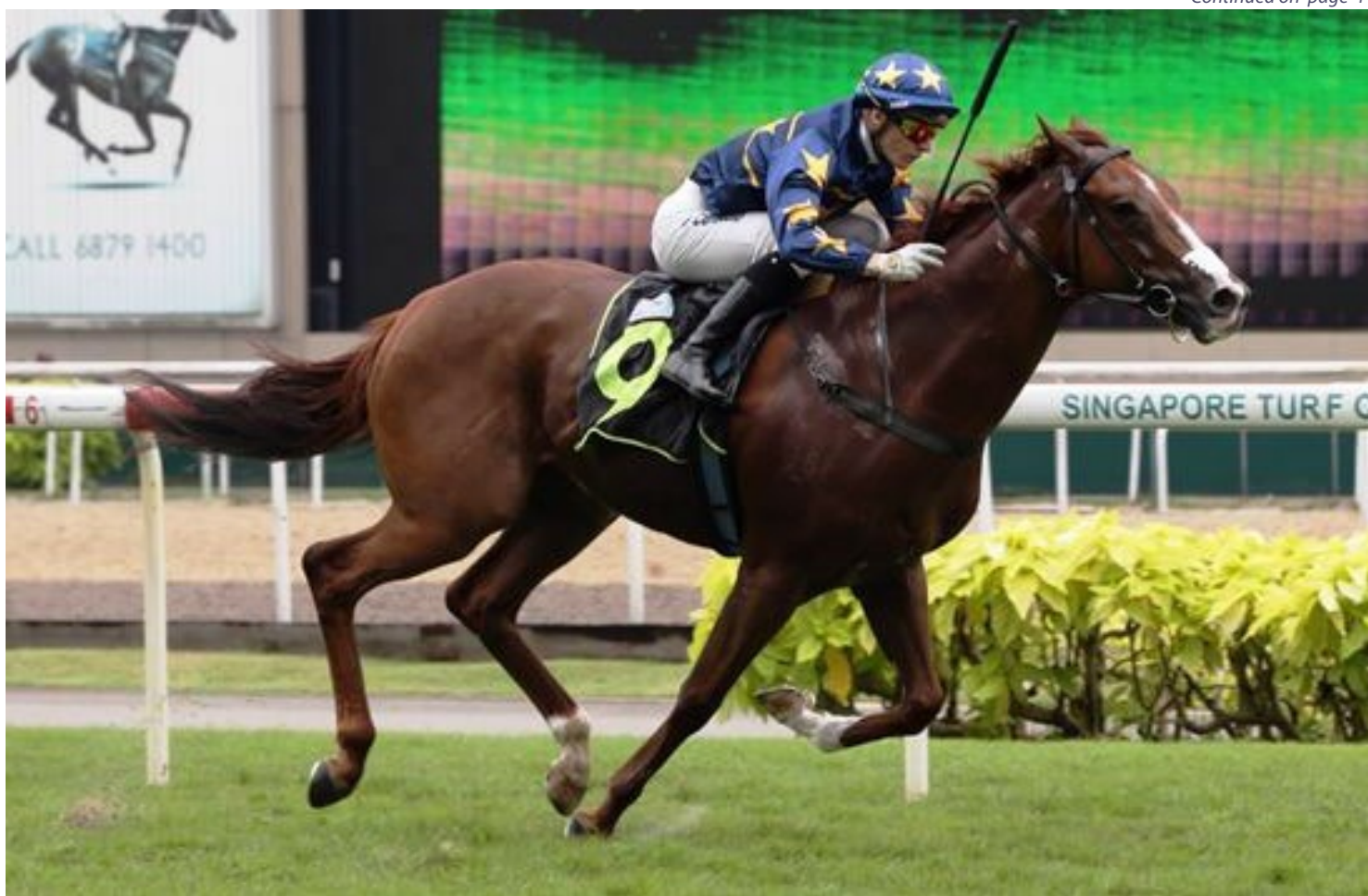
Lim's Regard led all the way to win at the Singapore Turf Club on Friday