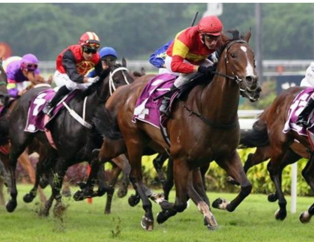
Be Bee stamps his class in the Singapore 3yo Sprint on Friday