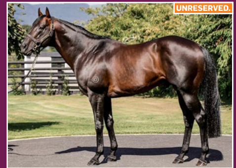
RIOS - GROUP ONE PRODUCING SON OF HUSSONET.