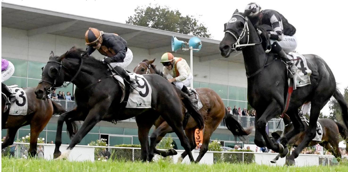
Our Abbadean (No. 9) beats Five To Midnight (No. 4) in the Gr. 2 City of Palmerston North Awapuni Gold Cup