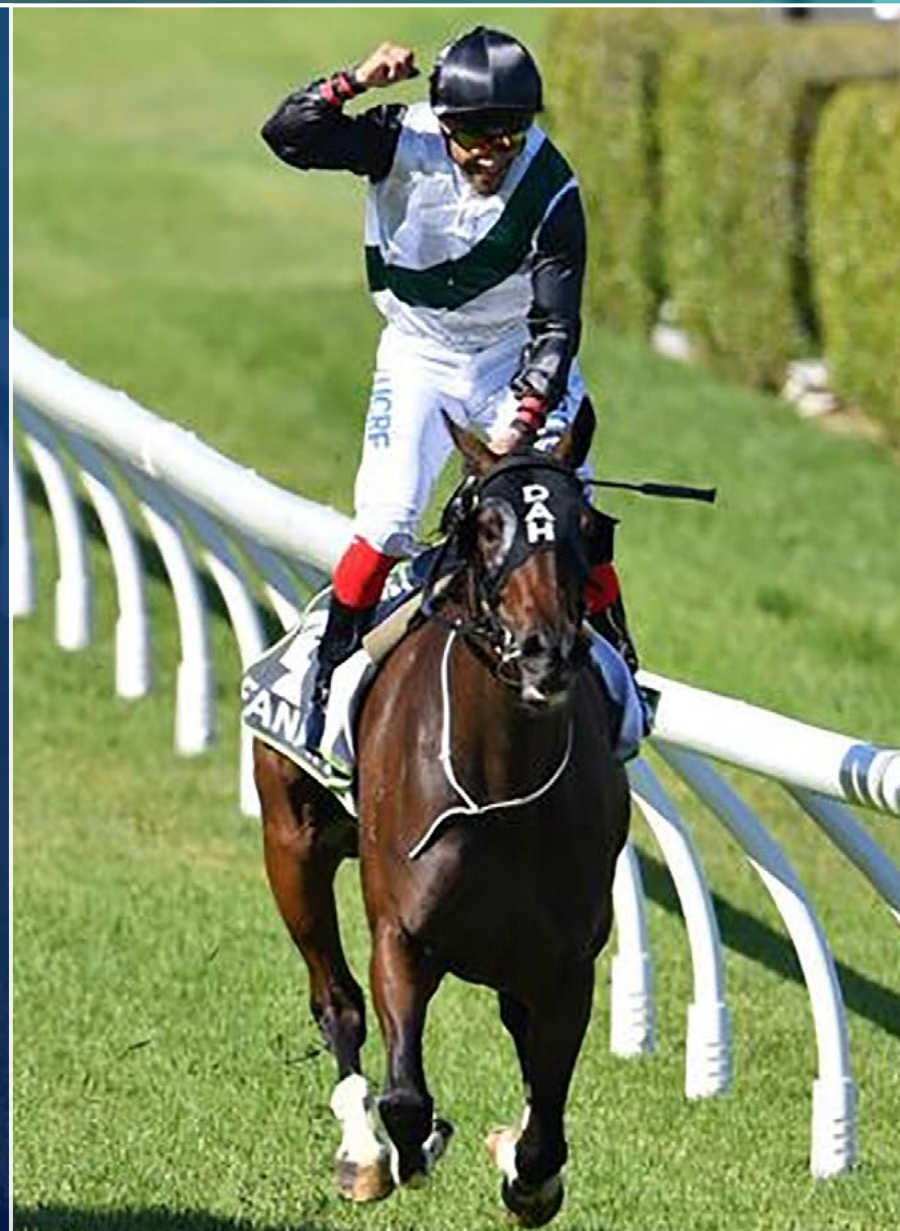
Fanatic wins the 2018 Gr.2 Adelaide Cup Heading for 2018 Melbourne Cup

Antonio Giuseppe, Hello M'Lady Camino Rocosu, High Class Megawatt, Electric Aura... Etc