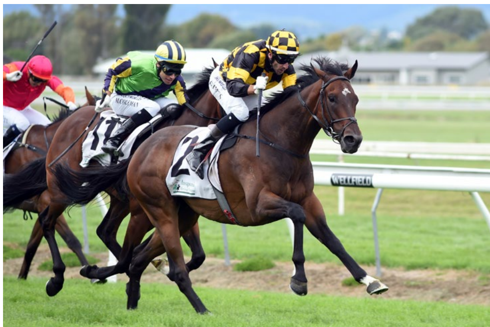
Quality three-year-old Sherrif was an impressive Awapuni winner in the Gr.3 Higgins Concrete Manawatu Classic