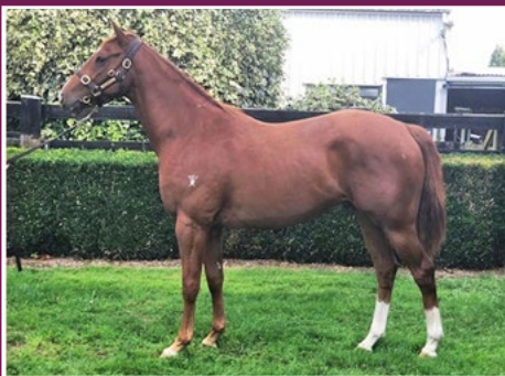
WELL-RELATED SUPER EASY COLT FROM A WINNING PINS MARE.