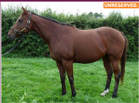
HALF TO A GROUP ONE WINNER IN FOAL TO REDWOOD.